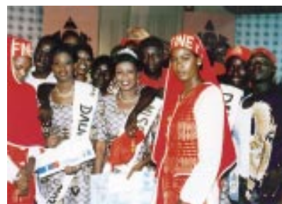
The Miss Niger beauty contest is also sponsored by Fine.

Traditional wrestling, the most popular sport in Niger, is sponsored by Fine cigarettes, which are manufactured by Seita/Altadis.