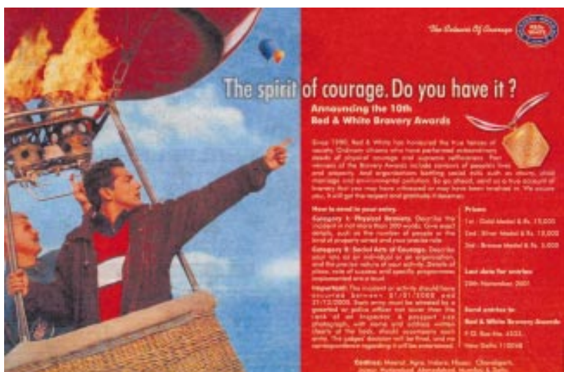
Red and White cigarette ads disguised as advertisements for a national bravery award.

In South Africa, Rembrandt, now subsumed into BAT, used a surf rescue helicopter with a huge assortment of ground backup vehicles, all plastered with its John Rolfe cigarette brand identifiers, to capture the attention of child-rich crowds at seaside holiday resorts, until it was grounded by the country's new tobacco control legislation ( Tobacco Control 1998;7:9 and 1999;8:363-4). Earlier, Rothmans had used a similar device in New Zealand