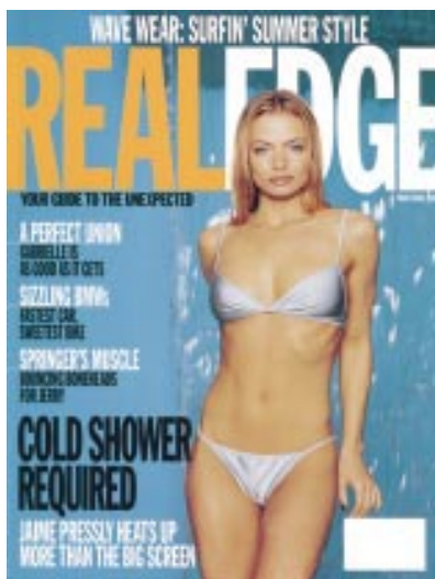
Cover of a recent edition of Real Edge , a "lad's" magazine mail shot financed by BAT's US subsidiary Brown & Williamson.

Next through the catflap came One World , an independent publication aimed at African Americans and other ethnic minorities (our informant's breed and fur-type are not known), in which B&W had bought a generous five full pages of advertising space, topping off a bulk purchase for its