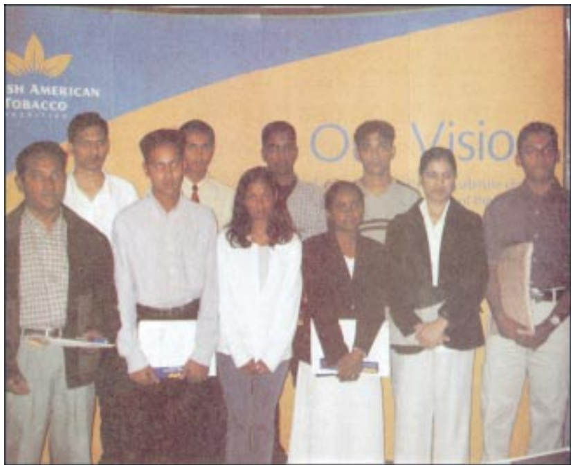
This picture from a newspaper in Mauritius offers a classic illustration of highly focused efforts to buy favour from a developing country government, presumably to reduce any risk of effective tobacco control action. BAT recently awarded educational bursaries to these 10 students from economically deprived areas.

The refreshingly realistic and un-stuffy analysis, which might have been written specially for this column, added that in many countries existing laws are stricter than the provisions of