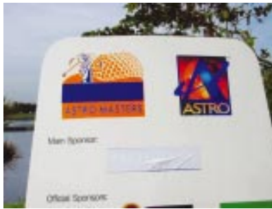
A banner at a Bangkok golf tournament, with the name and logo of Mild Seven covered over.

logo of Mild Seven, the main sponsor. While unable to prosecute the organisers, the officials had the satisfaction of knowing that Japan Tobacco may have learned how serious Thailand is about enforcing its law.