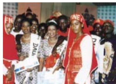
The Miss Niger beauty contest is also sponsored by Fine.

Traditional wrestling, the most popular sport in Niger, is sponsored by Fine cigarettes, which are manufactured by Seita/Altadis.