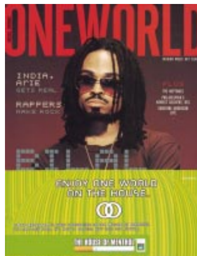
One World magazine mail shot, targeted at African Americans and other ethnic minorities, with a special wrapper promoting Kool cigarettes, plus five pages of B&W advertisements.

mailing list with a special wrapper promoting Kool cigarettes. This invited Deep Whisker to "Unwrap Something Authentic" (a good word for addressing minorities, that), and to "Enjoy One World on the House". Other mail shots have arrived from the list, too, including a Kool brand promotion linked to a music tour, with cards for getting friends added to the mailing list, and special offer coupons for buying cigarettes.