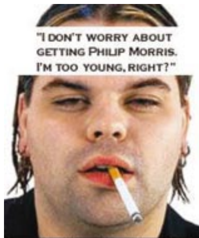
As part of its rebranding effort, lung cancer will place posters like this in doctor's offices.

An ersatz poster spoofing the name change of Philip Morris.