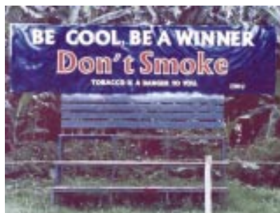
The first anti-tobacco billboard at a sports ground in East Africa was unveiled at the Kampala Rugby Football Club in Uganda last year.

East Africa was unveiled at the Kampala Rugby Football Club last year. It resulted from a Ush2 000 000 (US$1250) sponsorship package for the Kobs Rugby Football Club put together by The Environmental Action Network (TEAN), a group of young Ugandan lawyers, and Kampala's Bon Appetit Restaurant. A particularly pleasing irony is that the same billboard was previously used by BAT for Embassy cigarette ads. Kobs is a leading rugby team that draws its players from secondary schools, and the sponsorship package stipulates that the players will wear No Smoking logos on the leg of their shorts, and will sign a no smoking pledge to keep their game smoke-free. There are also plans to play recordings of health warnings against tobacco during Kobs games.