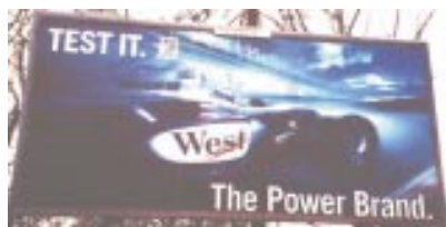
Billboards like these are ubiquitous in Belgrade. The ad for West, produced by the German company Reemtsma, exploits the brand's Formula One sponsorship, while Best, produced by domestic manufacturer DIN and showing notable similarities in design, makes the most of sponsoring Yugoslavia's internationally renowned handball team.

words do not refer to the new political freedom. Instead they are sound bites from the international tobacco industry.