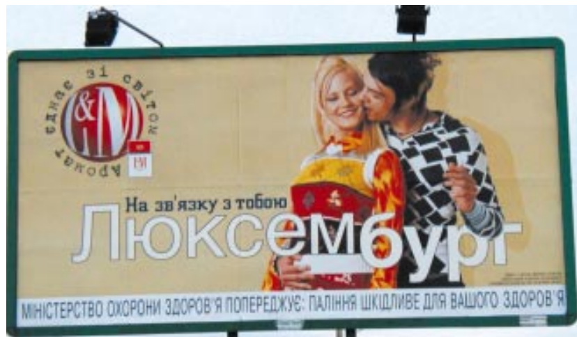
Ukrainian advertisement for the Philip Morris brand L&M, seemingly encouraging smoking during pregnancy.

All these culminated in the Keep Saen Saeb Canal Clean Project, created