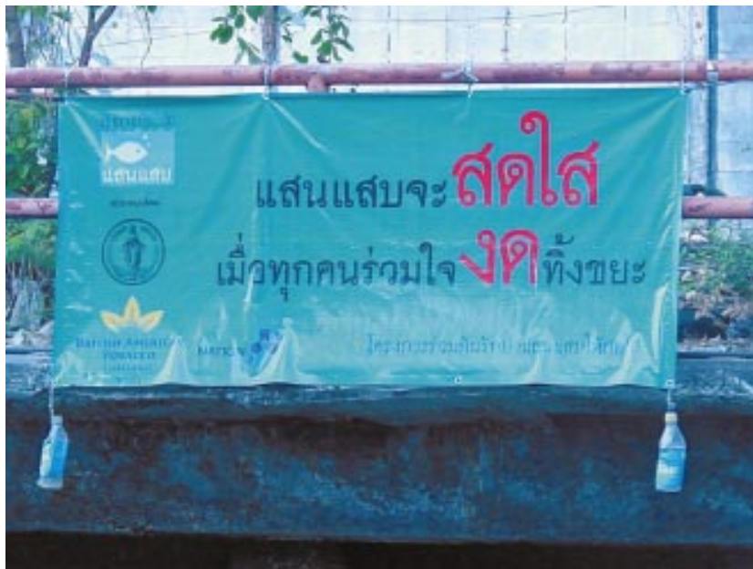
Billboard alongside the Saen Saeb canal in Bangkok, featuring the British American Tobacco logo. Although BAT were the main sponsors of the Keep Saen Saeb Canal Clean Project, the company's funding was described by one Thai health official as "this blood-stained donation to charity", and the publicity was promptly stopped.

More news from Germany, tobacco rent-a-nation of the European Union (EU), where the fight by industry interests against relatively small health forces continues to produce some extraordinary anomalies in a country so long at the forefront of technological progress. In December,