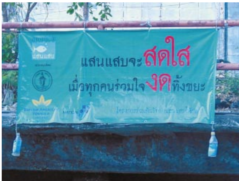
Billboard alongside the Saen Saeb canal in Bangkok, featuring the British American Tobacco logo. Although BAT were the main sponsors of the Keep Saen Saeb Canal Clean Project, the company's funding was described by one Thai health official as “this blood-stained donation to charity”, and the publicity was promptly stopped.

More news from Germany, tobacco rent-a-nation of the European Union (EU), where the fight by industry interests against relatively small health forces continues to produce some extraordinary anomalies in a country so long at the forefront of technological progress. In December,