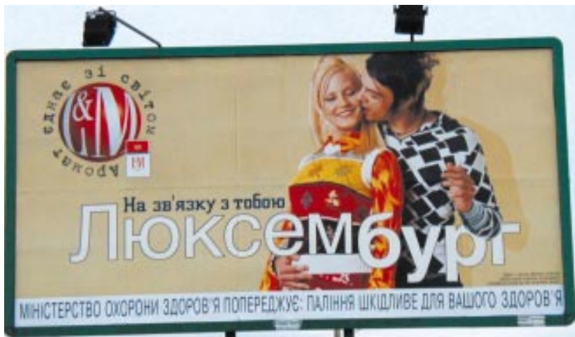
Ukrainian advertisement for the Philip Morris brand L&M, seemingly encouraging smoking during pregnancy.

All these culminated in the Keep Saen Saeb Canal Clean Project, created