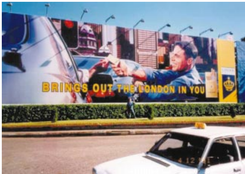
Despite Myanmar still being a comparatively closed society, British American Tobacco seems to have had no trouble moving in and putting up this giant billboard in the capital, Rangoon.

Perhaps it is all part of a highly practical view of man's life cycle, originally developed several millennia ago in some little known corner of India's long tradition of philosophy, and imbued with a particularly stoical acceptance of life's many sufferings. In India, these include a massive amount of cancer and other diseases caused by tobacco, resulting in at least 600 000 premature deaths each year, possibly as many as a million. The theory might go like this: cigarettes kill about half their lifetime users before their time, thereby increasing the potential availability of dead bodies for research. This in turn helps train more doctors and scientists, who produce new advances in the prevention and cure of disease,