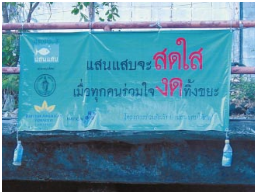
Billboard alongside the Saen Saeb canal in Bangkok, featuring the British American Tobacco logo. Although BAT were the main sponsors of the Keep Saen Saeb Canal Clean Project, the company's funding was described by one Thai health official as “this blood-stained donation to charity”, and the publicity was promptly stopped.

More news from Germany, tobacco rent-a-nation of the European Union (EU), where the fight by industry interests against relatively small health forces continues to produce some extraordinary anomalies in a country so long at the forefront of technological progress. In December,