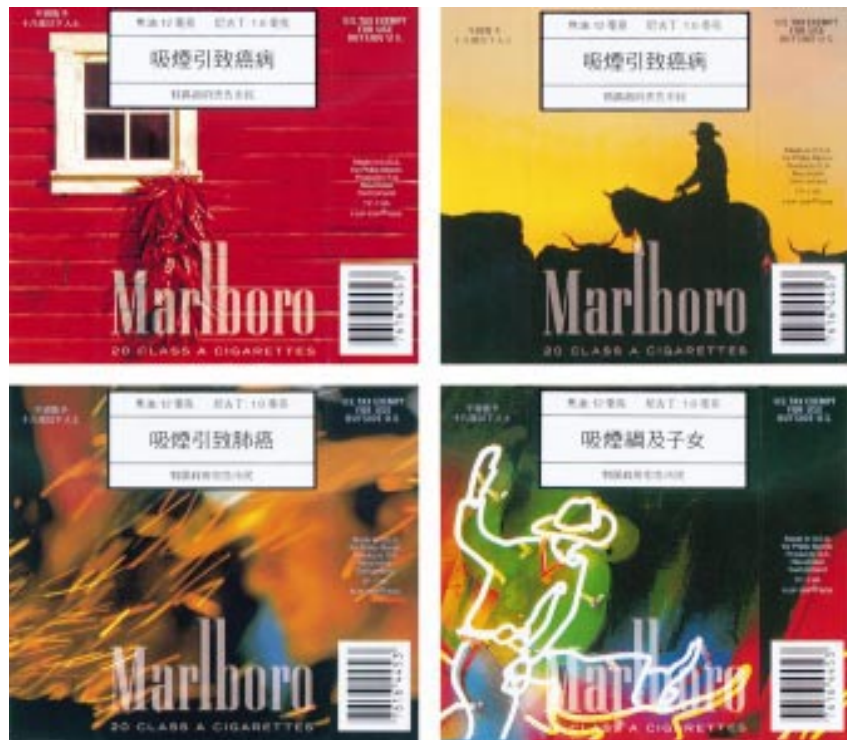
Images on packs of Marlboro sold in Hong Kong: "pocket sized mini-billboards".

The most frequent mutation affecting smokers or former smokers concerns codons 12 and 13 of K-ras, with the first nucleotides of codon 12 mostly affected (65%) in smokers who develop adenocarcinoma to the lung. That mutation was found in the case of the late Mario Stalteri. The three person expert panel concluded therefore that "a serious and reasonable criterion of probabilistic evidence confirms that smoking has been a