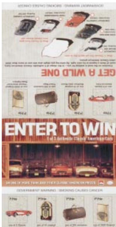
Marlboro promotional campaign advertisements in Sri Lanka, in which entrants could win a classic American car.

image, everything on a Gold Street pack is in English—except for the Urdu health warning.