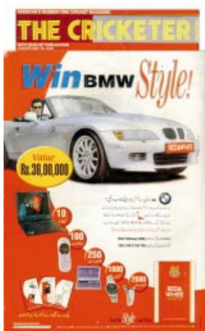
Philip Morris ads for its Red and White brand, which appeared in the Pakistan sports journal The Cricketer —a popular magazine for teenage boys.

wherever he goes. He is known to millions through his starring role in one of the country's most popular television drama series. What a catch, then, for British American Tobacco (BAT), whose Gold Street cigarettes he has been helping to promote. Interestingly, the brand bears a remarkable resemblance to the colours and design of the company's Benson & Hedges brand, using the same gold background together with a similar font for the name. And in keeping with the international companies' use of western references to present an upmarket