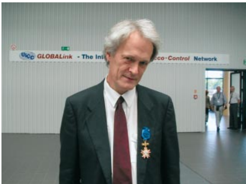
At the opening session of the Third European Conference on Tobacco or Health held in Warsaw in June, the First Lady of Poland, the wife of the country's President, invested British epidemiologist Professor Sir Richard Peto with the Order of Merit of the Republic of Poland (Officer Cross) for his contribution over many years to the country's long and successful fight against diseases caused by tobacco.

It should be added that having no budget for this sort of thing, the doctors who organised the meeting