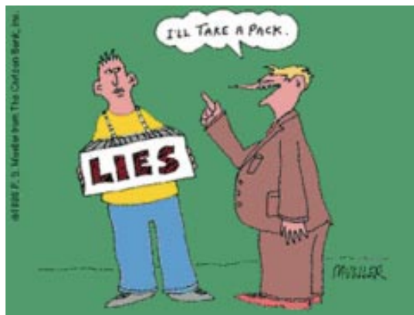
©The New Yorker Collection. Peter Mueller from Cartoonbank.com. All Rights Reserved.

that there is still little money available for tobacco control work in developing countries. These people have the courage and motivation to fight against the big tobacco giants, but shortage of money always lets them down. Even the cost of printing any materials comes out of their own pockets. Anyone with a solution can contact the doctors' network via this journal.