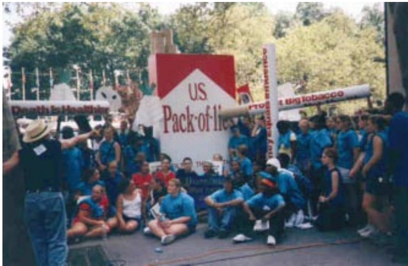
Demonstrators outside the UN building in New York, calling on the US government to take a more responsible role in the FCTC negotiations.