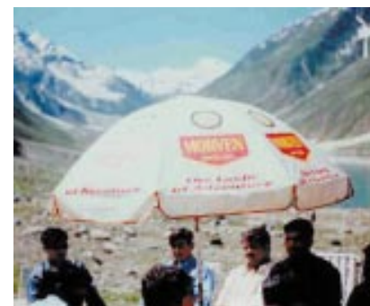
Tobacco promotion continues to reach the most remote regions of the world—this time, the beautiful surroundings of Lake Saif-ul-Malok in northern Pakistan.

Meanwhile in September, doctors and other health advocates at the other end of the country received a bitter disappointment. Having been encouraged to think that the government, after some unusually severe prodding in recent years, was actually going to bite the bullet on tobacco control, they found when they saw the long awaited measures that they bore the unmistakable fingerprints of the tobacco industry. Firstly, the draft