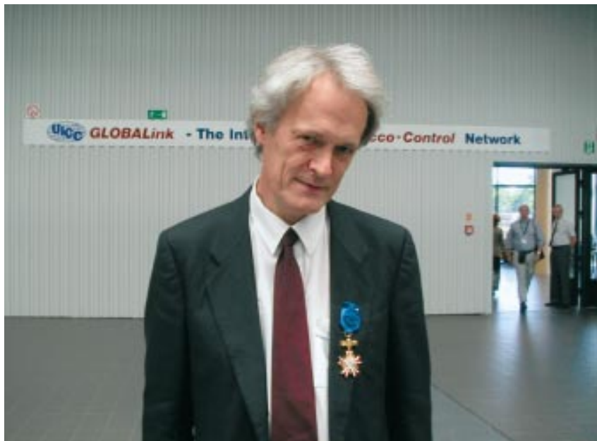
At the opening session of the Third European Conference on Tobacco or Health held in Warsaw in June, the First Lady of Poland, the wife of the country's President, invested British epidemiologist Professor Sir Richard Peto with the Order of Merit of the Republic of Poland (Officer Cross) for his contribution over many years to the country's long and successful fight against diseases caused by tobacco.

It should be added that having no budget for this sort of thing, the doctors who organised the meeting