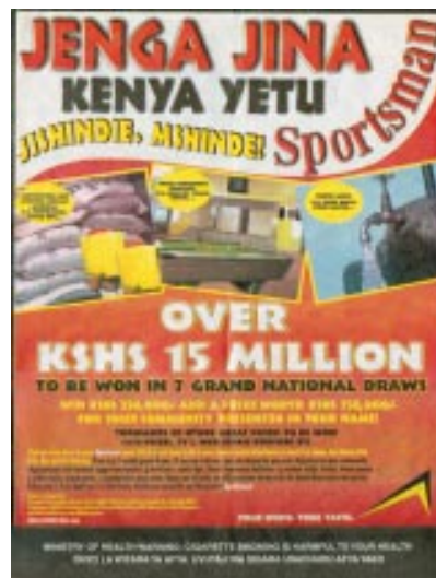
British American Tobacco (BAT) is continuing to promote its Sportsman brand in Kenya as if smoking it were an integral part of the country's development plan. Just as previous ads featured competitions to win a business (see Tobacco Control 2001;10:207), a recent ad offered prizes to benefit the winners' communities, to be presented in the winners' names, such as agricultural fertiliser, market stalls and kiosks, and even a new water supply for the village.

ence, “Let's walk towards a healthy lifestyle without smoking”. Considering the national importance of cricket, originally introduced to the country along with cigarettes by Sri Lanka's former colonial rulers, the UK, this was a ball hit for six by an important new player for the health side.