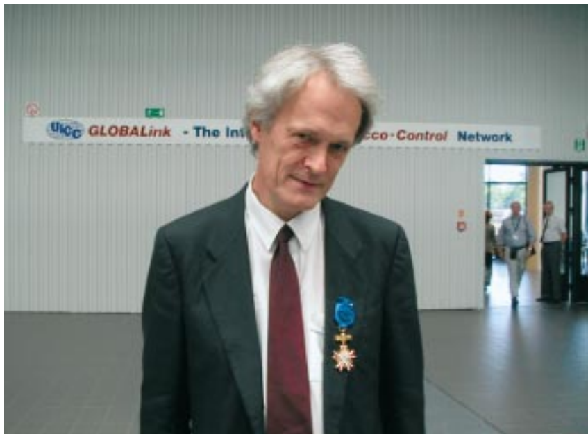
At the opening session of the Third European Conference on Tobacco or Health held in Warsaw in June, the First Lady of Poland, the wife of the country's President, invested British epidemiologist Professor Sir Richard Peto with the Order of Merit of the Republic of Poland (Officer Cross) for his contribution over many years to the country's long and successful fight against diseases caused by tobacco.

It should be added that having no budget for this sort of thing, the doctors who organised the meeting