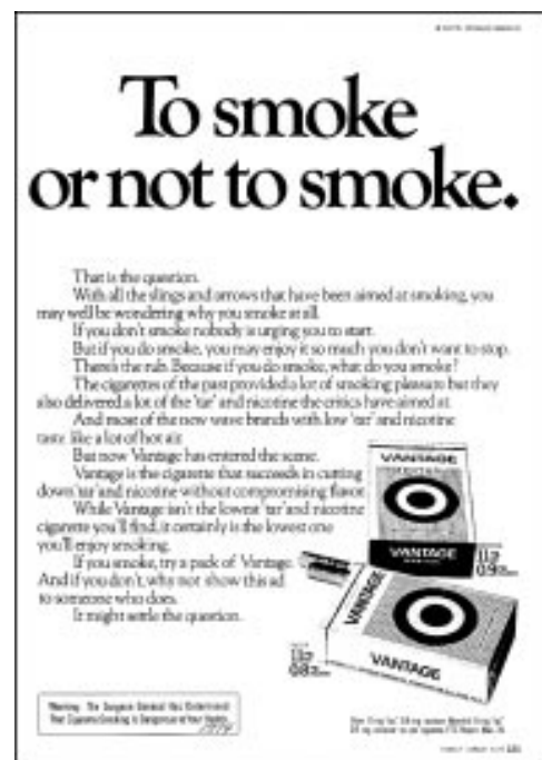
Figure 13 Vantage "To smoke or not to smoke" (1974).

Images and ad copy had to be carefully selected, lest the ads reinforce fears rather than offer reassurance. In 1980, one Vantage ad made direct reference to "what you may not want" from a cigarette, only to discover that it alarmed some readers about cancer. "The fact that a Vantage ad dares to raise the issue of 'what you may not want' generates defensiveness