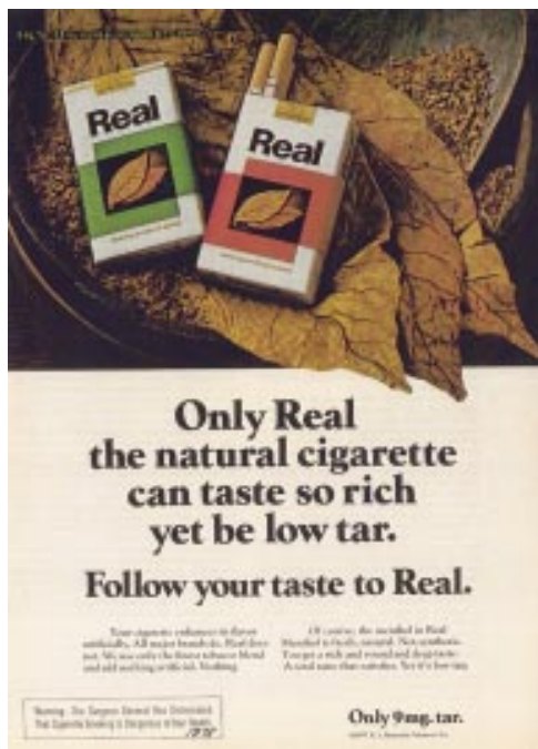
Figure 8 Real "Natural" (1977).

special needs of smokers . . . NOW: Lowest tar and sophistication. Our efforts were highly targeted in terms of advertising copy, media, point-of-sale, and consumer sampling . . . Against the highly concerned urbane smoker". 57