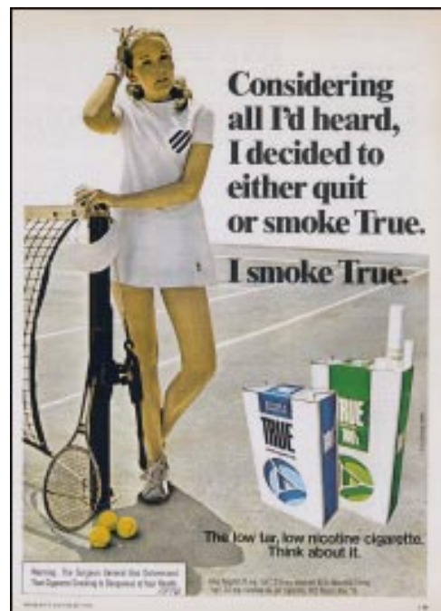
Figure 10 Quit or smoke True as equivalent options (1976)

B&W articulated the dual objectives of good advertising—providing reassurance about healthfulness (without, of course, doing so in a heavy handed way to induce defensiveness) and also providing a socially attractive brand image the smoker could acquire when buying and displaying the package. "Good cigarette advertising in the past has given the average smoker a means of justification on the two dimensions typically used in anti-smoking arguments: 1. High performance risk dimension . . . 2. Ego/status risk dimension . . . For some smokers reduction in physical performance risk is paramount, for others reduction in 'ego/status' risk comes first . . . All good cigarette advertising has either directly addressed the anti-smoking arguments prevalent at the time or has created a strong, attractive image into which the besieged smoker could withdraw" [emphasis in original]. 74