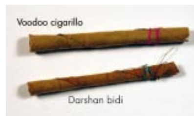
Figure 1 Voodoo cigarillo and Darshan bidi.

So we ask, is this new product a cigarillo or a bidi with new packaging? Federal regulations define a cigarette as any roll of tobacco wrapped in paper or in any substance not containing tobacco. 3 The US Bureau of Alcohol, Tobacco and Firearms previously concluded the bidi wrapper did not contain tobacco and, therefore, bidis were subject to the federal cigarette tax. 4