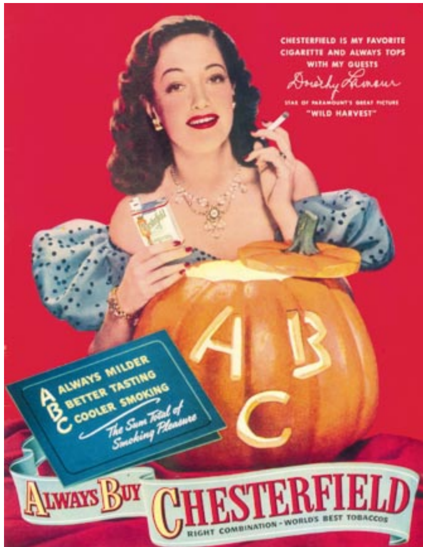
This 1947 magazine ad from the Liggett and Myers Tobacco Company was found in an antique shop near Lake Geneva, Wisconsin, USA. The tobacco industry knew over 50 years ago that movie stars could be great promoters of cigarettes.