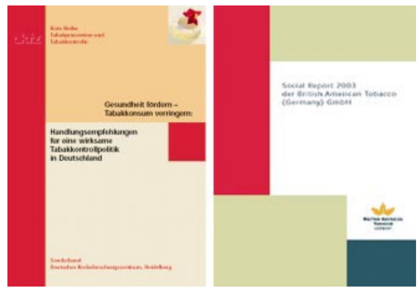
Spot the difference! The covers of the German public health report on tobacco (left panel) and BAT's own social report for 2003 (right panel).

Control 2000; 9 :271). Nowadays, as part of their attempts to reinvent themselves after exposure of their past dishonesty in the Minnesota documents and similar revelations, big tobacco companies are trying a different approach. They attempt to set up dialogues with health organisations and others that are trying to address the massive damage to health caused by tobacco, as if to suggest that they are somehow linked together as colleagues.