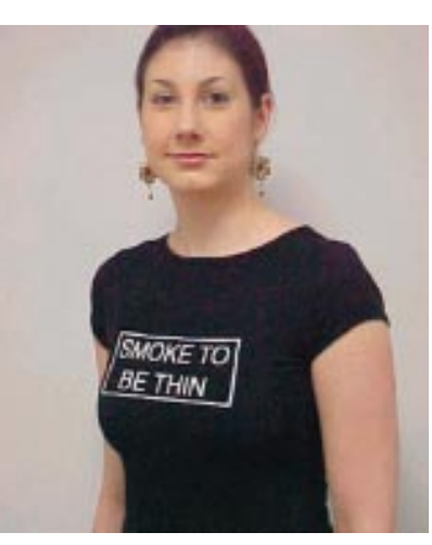
T shirts featuring this distinctly unhelpful message directed at young women went on sale in Australia, but were subsequently withdrawn.

Quit Victoria purchased one of the figure hugging women's T shirts in Melbourne; similar shirts were purchased in Perth, Western Australia. SUPRÉ, with 101 stores across Australia, describes itself as a hip brand for young women. SUPRÉ's website says its mission is to be at the forefront of global youth fashion: "SUPRÉ will definitely achieve this by focussing on: more fashion, better music, maximum excitement, total fun and much more sex appeal!!" However, the sale of the shirt may breach section 15 of Australia's Tobacco Advertising Prohibition Act. The Act defines a "tobacco advertisement" to mean "any writing ... that