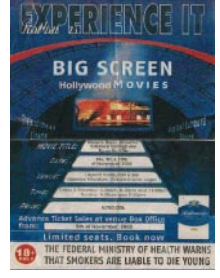
BAT's promotional campaign, "Experience It", featuring five Hollywood movies. At the events, young people were given free cigarettes, and even given help to light them.

Last November, BAT launched a promotional campaign called "Experience It" in Nigeria, featuring five blockbuster Hollywood films. All five movies screened or advertised—Ocean's Eleven, Matrix, ShowTime, Romeo Must Die, and Collateral Damage—are Warner Bros productions. The promotional campaign was national, reach-