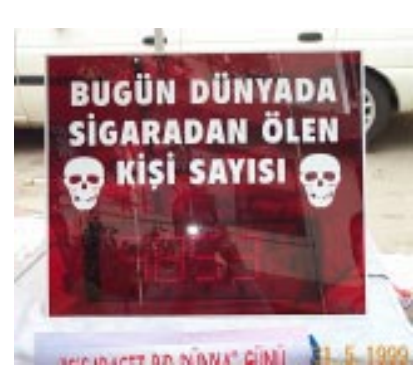
The "death clock", used to educate the Turkish public about the dangers of smoking.