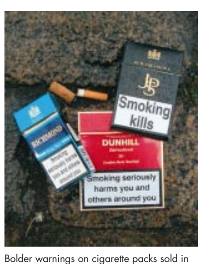
Bolder warnings on cigarette packs sold in the UK appear to be having the desired effect, with calls to smoking help lines greatly increasing.

The new series of warnings, one on the front and a different one on the back of every pack, have triggered a large increase in calls to the National Health Service's smoking telephone help line. More than 10 000 people said they were driven to call by the