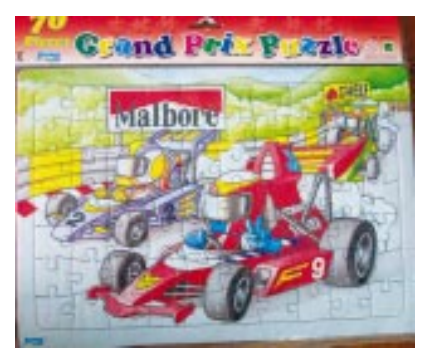
Some tobacco promotion in Turkey is complex, even unintended, as in this child's jigsaw featuring the Marlboro logo, but with a small change to the name.

Meanwhile, the newly inspired medical activists have been monitoring tobacco promotion, all of which is now supposed to be illegal. Even before the end of the Ankara course, students spotted a nearby Gitanes ad on a street sign to a bar, and arrangements were made to pursue this with the authorities. In Bursa, in the west of the country, several child friendly items were located which were more difficult to deal with, as they had not necessarily come from tobacco companies themselves. Instead, they were classic examples of the goodwill of individual cigarette brands being so great, and the social acceptability of smoking being so widespread, that manufacturers of other goods imitate cigarette brand characteristics to