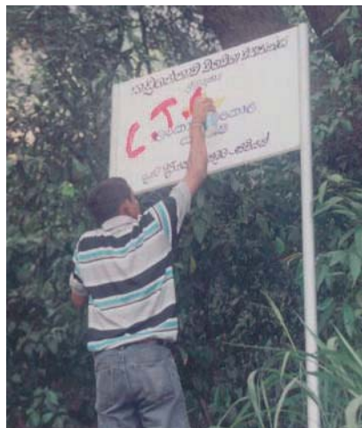
A young Sri Lankan protester “improving” one of the BAT sponsored signs in the Sri Lankan National Remembrance Park. The completed message read “CTC kills children”.

Doubtless the BAT/CTC people responsible were sincere in their appreciation of the fallen, but a cynic might consider the irony that tobacco executives may hold a parallel, sincere appreciation of all those who are addicted to their company’s products. These customers risk sacrificing their lives by the daily satisfaction of their addiction, in a commercial process encouraged by massive promotion, so that the executives and shareholders may live in greater personal, economic peace than might otherwise be likely.