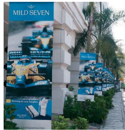
Saturation tobacco promotion was very much in evidence at the recent Formula One motor race in Malaysia.

Anyone who visited Malaysia in the 1980s and who turned on the television set in their hotel room was likely to see more tobacco promotion than they had ever seen before in a half hour of channel hopping. If they were there on public health business, they had an additional shock when they learned that the country had banned tobacco advertising on television. Ministry of health officials would announce this with sincerity, though some of them would admit that there were problems of circumvention. Did these stem from cross border television, which can be so troublesome to a tobacco control leader with less enlightened neighbours? No, the ads were on Malaysian TV, but were not for cigarettes at all, but for those well known but impossible to obtain products such as Marlboro and Kent holidays, or Camel clothing. In those days, no tobacco control advocate's conference presentation was complete without slides or video clips showing how tobacco companies were exploiting Malaysia and its innocent government.