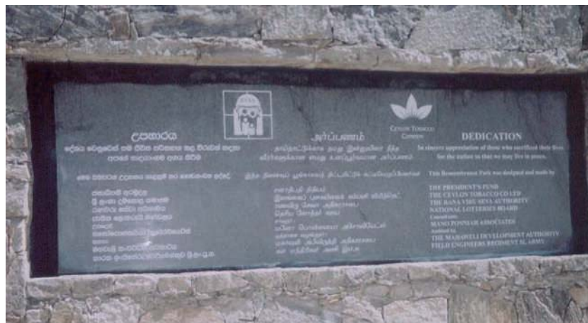
BAT’s golden tobacco leaf logo is prominently displayed on a stone memorial tablet in Sri Lanka’s National Remembrance Park.

CTC’s name and logo appear not only on signs leading visitors to and around the park, but prominently engraved for posterity on a stone memorial tablet at the solemn heart of the place, above the inscription: “In sincere appreciation of those who sacrificed their lives for our nation so that we may live in peace.”