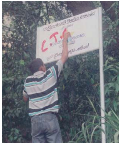
A young Sri Lankan protester “improving” one of the BAT sponsored signs in the Sri Lankan National Remembrance Park. The completed message read “CTC kills children”.

Doubtless the BAT/CTC people responsible were sincere in their appreciation of the fallen, but a cynic might consider the irony that tobacco executives may hold a parallel, sincere appreciation of all those who are addicted to their company’s products. These customers risk sacrificing their lives by the daily satisfaction of their addiction, in a commercial process encouraged by massive promotion, so that the executives and shareholders may live in greater personal, economic peace than might otherwise be likely.