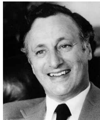
Actor Paul Eddington: an ASH supporter.

Eddington, a Quaker, had a long history of quiet involvement with important causes. When necessary, he was prepared to be a little less quiet, as when he publicly resigned in protest from the board of trustees of the Bristol Old Vic theatre company after it refused to end sponsorship from Wills Tobacco, which had a large factory in the city. He was a founder of a high profile group opposing tobacco sponsorship of the arts, and helped Action on Smoking and Health (ASH) on several occasions. Sadly, he did not live to see the UK’s ad ban—he died of a rare form of skin cancer in 1995—but he inspired and enlivened ASH’s work towards it.