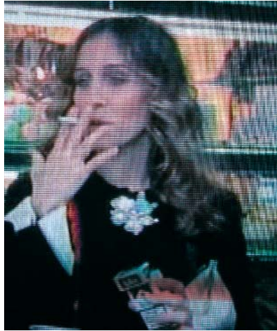
The “Sex and the City” season finale, in which the central character Carrie Bradshaw took up smoking again, appeared to glorify the activity.

In the case of “Sex and the City”, Ms Parker might have chatted with William B Davis, the “cigarette smoking man” of the wildly successful series, “The X-Files”. Davis, the arch villain of the series, was almost never seen without