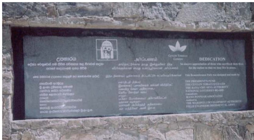
BAT’s golden tobacco leaf logo is prominently displayed on a stone memorial tablet in Sri Lanka’s National Remembrance Park.

CTC’s name and logo appear not only on signs leading visitors to and around the park, but prominently engraved for posterity on a stone memorial tablet at the solemn heart of the place, above the inscription: “In sincere appreciation of those who sacrificed their lives for our nation so that we may live in peace.”