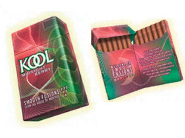
Tobacco companies continue to seek new ways of promoting their products to get around the restrictions imposed by the FCTC. Flavoured cigarettes are now being promoted in Brazil (left panel: Carlton Crema and Carlton Mint) and the USA (right panel: Kool Midnight Berry fruit flavour).