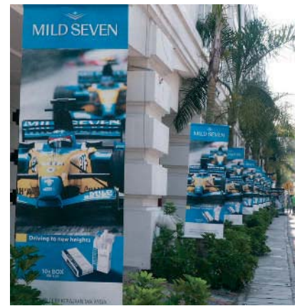
Saturation tobacco promotion was very much in evidence at the recent Formula One motor race in Malaysia.

Anyone who visited Malaysia in the 1980s and who turned on the television set in their hotel room was likely to see more tobacco promotion than they had ever seen before in a half hour of channel hopping. If they were there on public health business, they had an additional shock when they learned that the country had banned tobacco advertising on television. Ministry of health officials would announce this with sincerity, though some of them would admit that there were problems of circumvention. Did these stem from cross border television, which can be so troublesome to a tobacco control leader with less enlightened neighbours? No, the ads were on Malaysian TV, but were not for cigarettes at all, but for those well known but impossible to obtain products such as Marlboro and Kent holidays, or Camel clothing. In those days, no tobacco control advocate's conference presentation was complete without slides or video clips showing how tobacco companies were exploiting Malaysia and its innocent government.