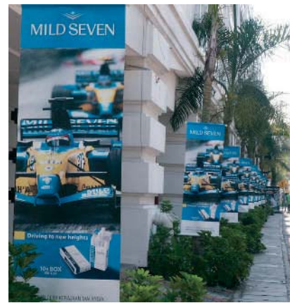
Saturation tobacco promotion was very much in evidence at the recent Formula One motor race in Malaysia.

Anyone who visited Malaysia in the 1980s and who turned on the television set in their hotel room was likely to see more tobacco promotion than they had ever seen before in a half hour of channel hopping. If they were there on public health business, they had an additional shock when they learned that the country had banned tobacco advertising on television. Ministry of health officials would announce this with sincerity, though some of them would admit that there were problems of circumvention. Did these stem from cross border television, which can be so troublesome to a tobacco control leader with less enlightened neighbours? No, the ads were on Malaysian TV, but were not for cigarettes at all, but for those well known but impossible to obtain products such as Marlboro and Kent holidays, or Camel clothing. In those days, no tobacco control advocate's conference presentation was complete without slides or video clips showing how tobacco companies were exploiting Malaysia and its innocent government.