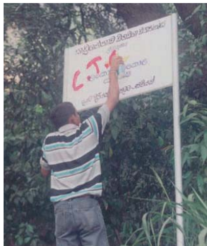
A young Sri Lankan protester “improving” one of the BAT sponsored signs in the Sri Lankan National Remembrance Park. The completed message read “CTC kills children”.

Doubtless the BAT/CTC people responsible were sincere in their appreciation of the fallen, but a cynic might consider the irony that tobacco executives may hold a parallel, sincere appreciation of all those who are addicted to their company’s products. These customers risk sacrificing their lives by the daily satisfaction of their addiction, in a commercial process encouraged by massive promotion, so that the executives and shareholders may live in greater personal, economic peace than might otherwise be likely.