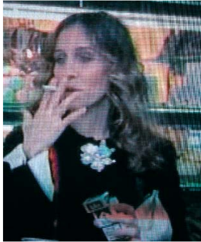
The “Sex and the City” season finale, in which the central character Carrie Bradshaw took up smoking again, appeared to glorify the activity.

In the case of “Sex and the City”, Ms Parker might have chatted with William B Davis, the “cigarette smoking man” of the wildly successful series, “The X-Files”. Davis, the arch villain of the series, was almost never seen without