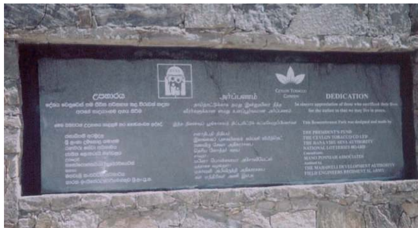
BAT’s golden tobacco leaf logo is prominently displayed on a stone memorial tablet in Sri Lanka’s National Remembrance Park.

CTC’s name and logo appear not only on signs leading visitors to and around the park, but prominently engraved for posterity on a stone memorial tablet at the solemn heart of the place, above the inscription: “In sincere appreciation of those who sacrificed their lives for our nation so that we may live in peace.”