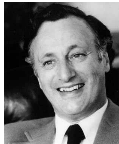
Actor Paul Eddington: an ASH supporter.

Eddington, a Quaker, had a long history of quiet involvement with important causes. When necessary, he was prepared to be a little less quiet, as when he publicly resigned in protest from the board of trustees of the Bristol Old Vic theatre company after it refused to end sponsorship from Wills Tobacco, which had a large factory in the city. He was a founder of a high profile group opposing tobacco sponsorship of the arts, and helped Action on Smoking and Health (ASH) on several occasions. Sadly, he did not live to see the UK’s ad ban—he died of a rare form of skin cancer in 1995—but he inspired and enlivened ASH’s work towards it.