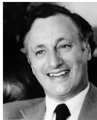
Actor Paul Eddington: an ASH supporter.

Eddington, a Quaker, had a long history of quiet involvement with important causes. When necessary, he was prepared to be a little less quiet, as when he publicly resigned in protest from the board of trustees of the Bristol Old Vic theatre company after it refused to end sponsorship from Wills Tobacco, which had a large factory in the city. He was a founder of a high profile group opposing tobacco sponsorship of the arts, and helped Action on Smoking and Health (ASH) on several occasions. Sadly, he did not live to see the UK’s ad ban—he died of a rare form of skin cancer in 1995—but he inspired and enlivened ASH’s work towards it.