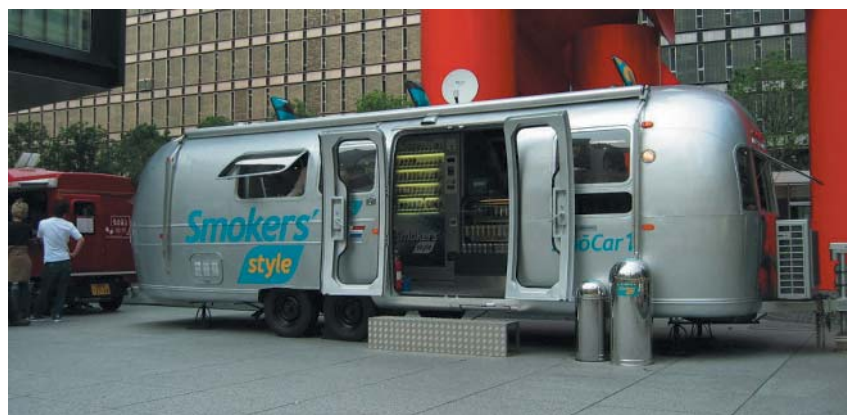
A mobile smoking van, Smocar, providing a place for smokers in Japan to smoke. Children are also allowed into the van, and given soft drinks.

Brazil played a major leadership role during the negotiations of the World Health Organization’s Framework Convention on Tobacco Control (WHO FCTC). Since the mid 1990s, the country’s national tobacco control policy has gained impetus, and the latest household based survey shows that regular adult (15+) smoking is declining, with current overall prevalence estimated at 19%. Brazil signed the WHO FCTC in