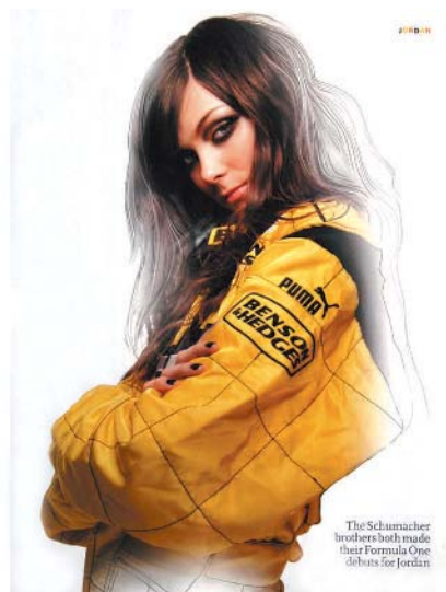
Readers of GQ magazine, a UK “lads’ mag”, were recently treated to shots of a young female model superimposed against a racing car, both clearly bearing the Benson & Hedges brand name and colours.