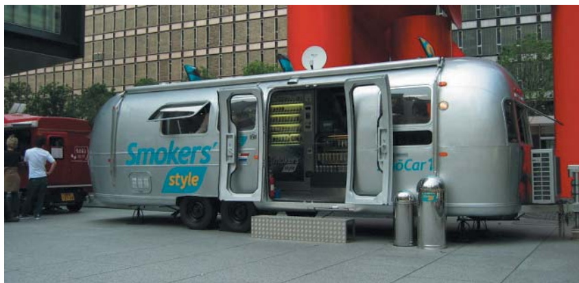
A mobile smoking van, Smocar, providing a place for smokers in Japan to smoke. Children are also allowed into the van, and given soft drinks.

Brazil played a major leadership role during the negotiations of the World Health Organization’s Framework Convention on Tobacco Control (WHO FCTC). Since the mid 1990s, the country’s national tobacco control policy has gained impetus, and the latest household based survey shows that regular adult (15+) smoking is declining, with current overall prevalence estimated at 19%. Brazil signed the WHO FCTC in