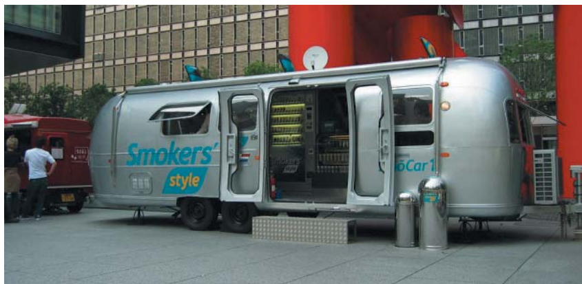
A mobile smoking van, Smocar, providing a place for smokers in Japan to smoke. Children are also allowed into the van, and given soft drinks.

Brazil played a major leadership role during the negotiations of the World Health Organization’s Framework Convention on Tobacco Control (WHO FCTC). Since the mid 1990s, the country’s national tobacco control policy has gained impetus, and the latest household based survey shows that regular adult (15+) smoking is declining, with current overall prevalence estimated at 19%. Brazil signed the WHO FCTC in