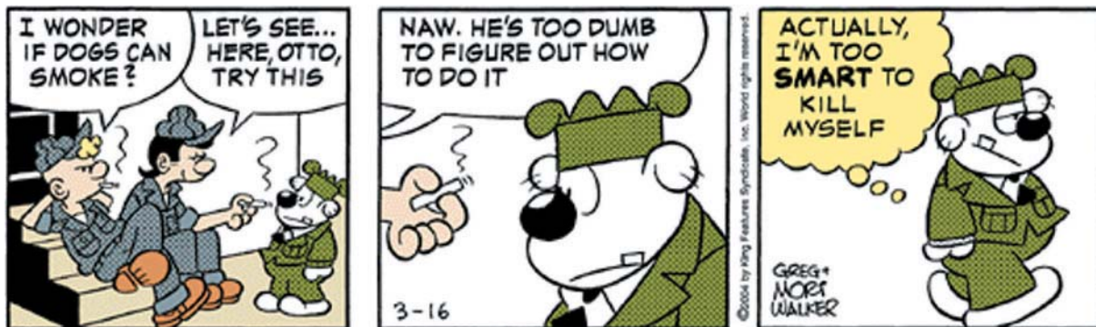
Beetle Bailey, by Greg & Mort Walker.