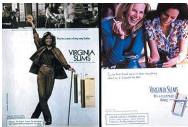
Figure 5 The left image is from the Virginia Slims "You've Come a Long Way, Baby" campaign in 1978; the right is from the "It's a Woman Thing" campaign in 1997. Virginia Slims' core user group was aging, and by the mid 1990s the feminist appeal of the long running "You've Come a Long Way, Baby" campaign was not well received by many younger women. PM recreated the Virginia Slims image by downplaying feminism and emphasising gender stereotyped female relationships. The caption of the right image reads, "If our best friend seems to know everything about us it's because she does. Virginia Slims. It's a woman thing".

Stereotypical gender differences and a return to the traditional war of the sexes may act as a means of carving out the exclusive in-group to which women belong. Respondents in Marketing Perceptions' research said, "Women build really close friendships. Men don't seem to ever be as close... Guys go out to lunch to eat. Women go to chat". 41 Similar statements are featured in Leo Burnett's