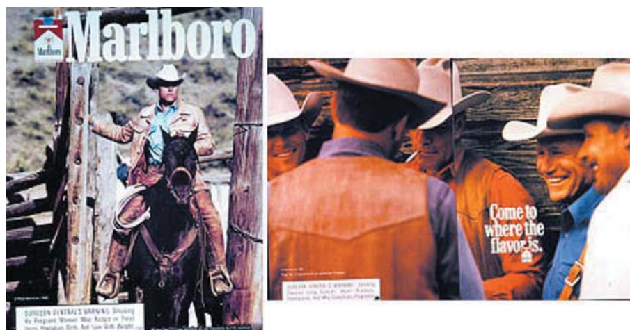
Figure 4 The left image of the stern and solitary cowboy is a Marlboro advertisement from 1960; the right image, updated to show friendly cowboys socialising, is from 1999. As the values of young people in the USA shifted away from rugged individualism and toward a sense of community, PM attempted to update the Marlboro Man image to maintain relevance with the younger market. The Marlboro Man in the 1990s began to smile, socialise, enjoy leisure time, and show his softer, more accessible side.