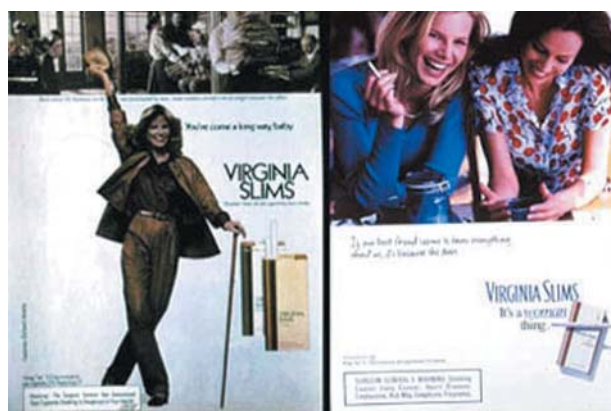
Figure 5 The left image is from the Virginia Slims "You've Come a Long Way, Baby" campaign in 1978; the right is from the "It's a Woman Thing" campaign in 1997. Virginia Slims' core user group was aging, and by the mid 1990s the feminist appeal of the long running "You've Come a Long Way, Baby" campaign was not well received by many younger women. PM recreated the Virginia Slims image by downplaying feminism and emphasising gender stereotyped female relationships. The caption of the right image reads, "If our best friend seems to know everything about us it's because she does. Virginia Slims. It's a woman thing".

Stereotypical gender differences and a return to the traditional war of the sexes may act as a means of carving out the exclusive in-group to which women belong. Respondents in Marketing Perceptions' research said, "Women build really close friendships. Men don't seem to ever be as close... Guys go out to lunch to eat. Women go to chat". 41 Similar statements are featured in Leo Burnett's