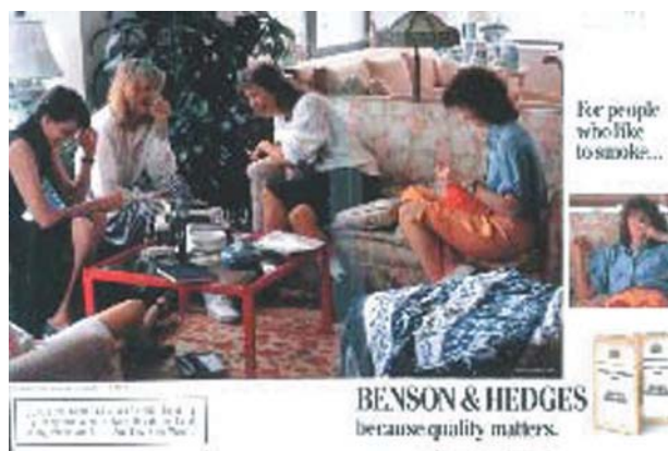
Figure 2 With the 1986 Benson & Hedges "For People Who Like to Smoke" campaign "Living Room Girls" execution, PM attempted to combat the declining social acceptability of smoking through brand image. "For People Who Like to Smoke" depicted casual, jovial scenes of upper middle class people enjoying meaningful time with friends and family, where conflict between smokers and non-smokers was entirely absent.

The tagline "For people who like to smoke" implied to the respondents a sense of sharing: "we're allies as smokers", "it