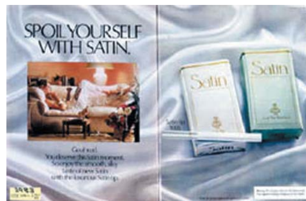
Figure 1 In this 1983 Satin “Couch” advertisement, the caption reads, “Go ahead. You deserve this Satin moment. So enjoy the smooth, silky taste of new Satin with the luxurious Satin tip”. With the Satin brand and advertising campaigns, Lorillard attempted to capture a sensuous image of highly feminine—not feminist—women. This campaign was designed to communicate a self indulgent, relaxing, escapist fantasy for mature, busy women, whether employed or not, who felt pressured by many demands on their time.

The 1982 Satin marketing strategy was “to convince the target that only Satin can pamper and gratify her special feminine needs and moods when it comes to smoking