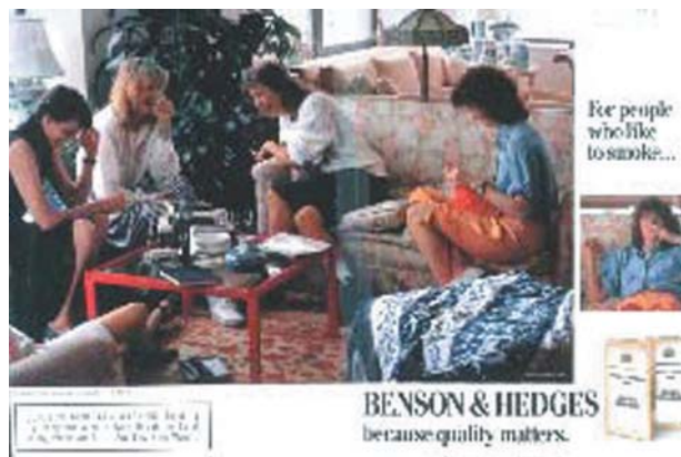
Figure 2 With the 1986 Benson & Hedges "For People Who Like to Smoke" campaign "Living Room Girls" execution, PM attempted to combat the declining social acceptability of smoking through brand image. "For People Who Like to Smoke" depicted casual, jovial scenes of upper middle class people enjoying meaningful time with friends and family, where conflict between smokers and non-smokers was entirely absent.

The tagline "For people who like to smoke" implied to the respondents a sense of sharing: "we're allies as smokers", "it