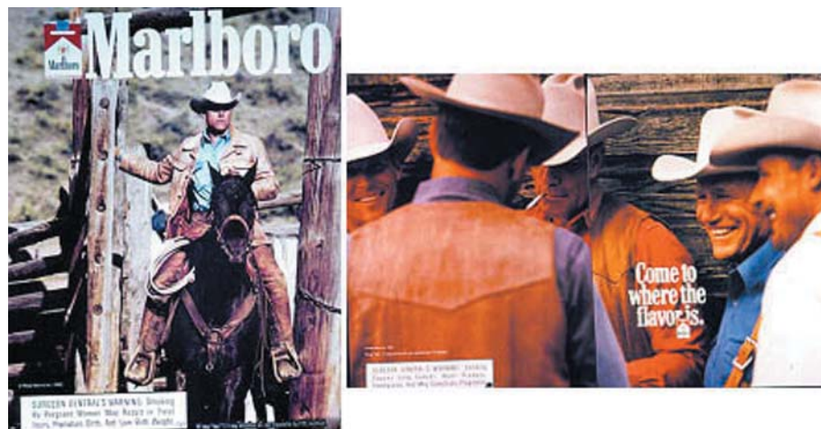
Figure 4 The left image of the stern and solitary cowboy is a Marlboro advertisement from 1960; the right image, updated to show friendly cowboys socialising, is from 1999. As the values of young people in the USA shifted away from rugged individualism and toward a sense of community, PM attempted to update the Marlboro Man image to maintain relevance with the younger market. The Marlboro Man in the 1990s began to smile, socialise, enjoy leisure time, and show his softer, more accessible side.