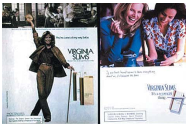
Figure 5 The left image is from the Virginia Slims "You've Come a Long Way, Baby" campaign in 1978; the right is from the "It's a Woman Thing" campaign in 1997. Virginia Slims' core user group was aging, and by the mid 1990s the feminist appeal of the long running "You've Come a Long Way, Baby" campaign was not well received by many younger women. PM recreated the Virginia Slims image by downplaying feminism and emphasising gender stereotyped female relationships. The caption of the right image reads, "If our best friend seems to know everything about us it's because she does. Virginia Slims. It's a woman thing".

Stereotypical gender differences and a return to the traditional war of the sexes may act as a means of carving out the exclusive in-group to which women belong. Respondents in Marketing Perceptions' research said, "Women build really close friendships. Men don't seem to ever be as close... Guys go out to lunch to eat. Women go to chat". 41 Similar statements are featured in Leo Burnett's