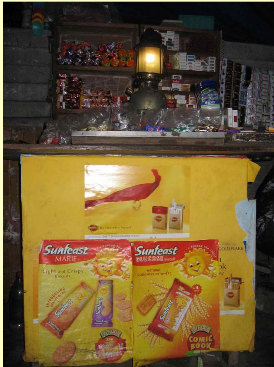
Figure 8: ITC Products: Sunfeast biscuits and Gold Flake cigarettes