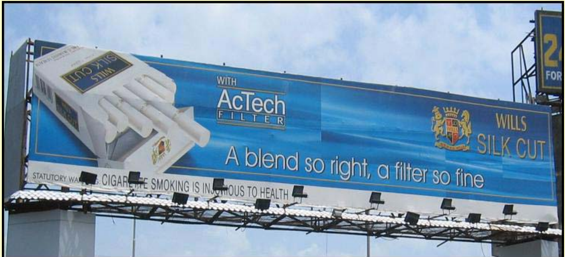
Figure 4a: Newly launched Wills Silk Cut cigarettes