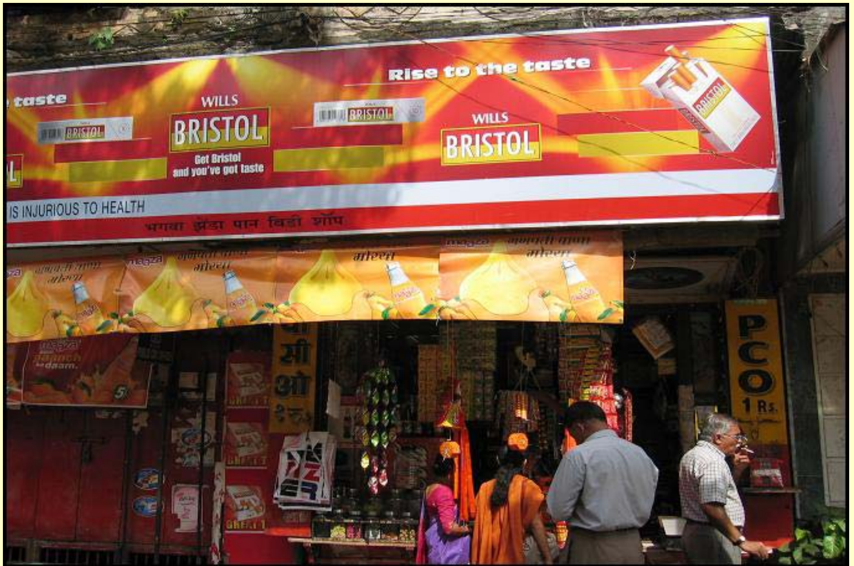
Figure 6: Bristol cigarettes advertised on a storefront sign