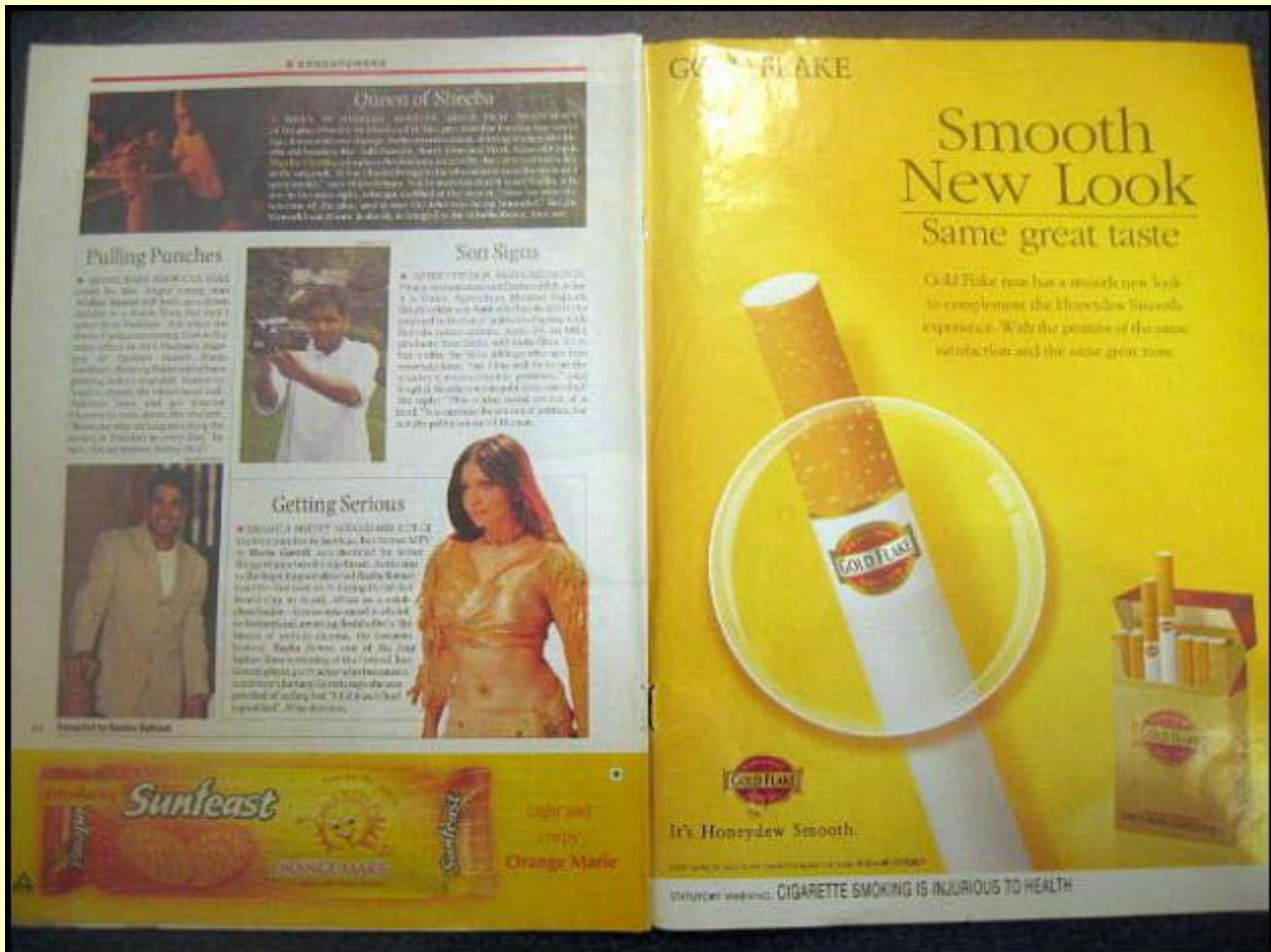
Figure 9: ITC Products: Sunfeast biscuits and Gold Flake cigarettes advertised in India Today magazine