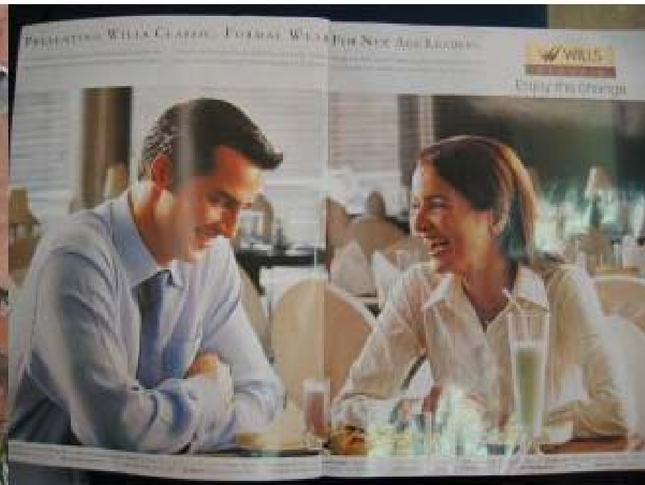
Figure 3. Wills Navy Cut cigarettes and Wills Classic Formal Wear advertisements. The Wills clothing advertisement features a couple, which is typical of Wills cigarette campaigns.