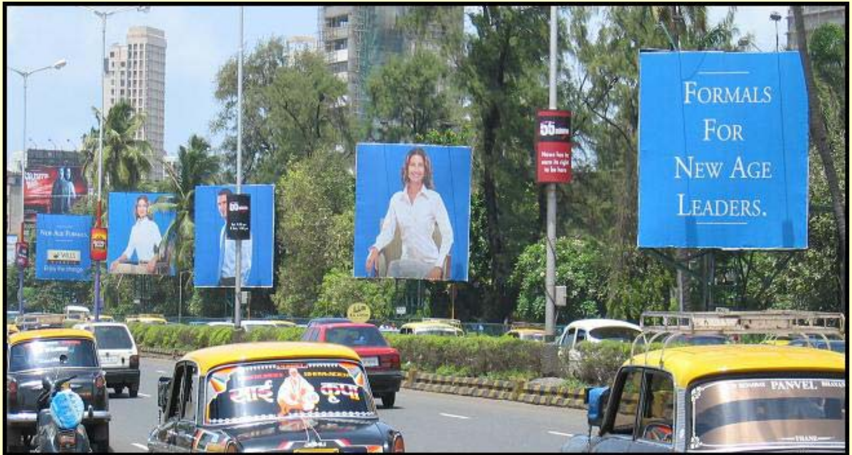
Figure 4b: Wills clothing advertisement billboards using color scheme similar to new Wills cigarettes