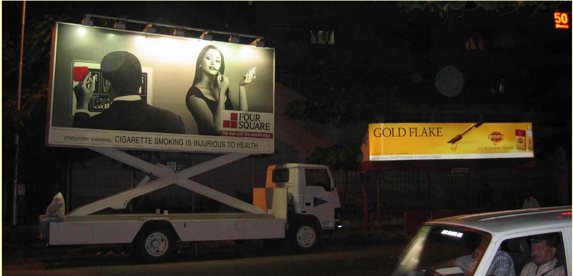
Figure 10: Four Square advertisement on a mobile truck next to a bus stop shelter featuring Gold Flake advertisement