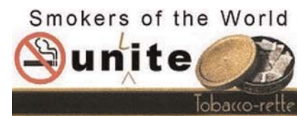
An advertisement for the Swedish Match company's oral tobacco product, Tobaccorette.

As public health workers around the world continue to debate harm reduction policies, including the place within them of oral tobacco, South Africa may be about to see whether a significant new body of South African cigarette smokers replaces some or all of their smoking with snus. They will also be watching to see how BAT markets the product and whether it tries to make health claims about it. Last year, scientists at the University of Pretoria confronted Swedish Match about health claims on a website advertisement that implied that Tobaccorette had no health hazards. The company later shut down the site, claiming it had not approved of the ad.