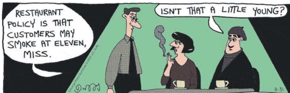
THE FUSCO BROTHERS © 2005 Lew Little Ent. Dist. By UNIVERSAL PRESS SYNDICATE. Reprinted with permission. All rights reserved.