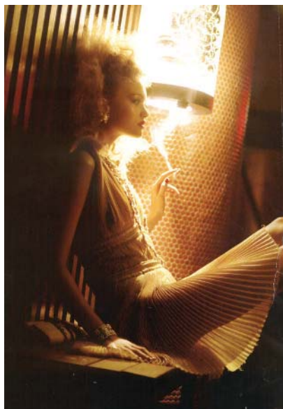
Fashion magazines such as Italian Vogue persist in showing young female models

most fashion conscious and stylish country in the world, passed and implemented more comprehensive legislation on smoke-free public places. Furthermore, the legislation appears to be working, with few breaches being reported. However, it would appear that some in the Italian fashion world are finding their addiction to tobacco more difficult to break. The March and April editions of Italian Vogue (regarded as the international fashion “bible”) persisted in showing young female models smoking in their fashion pages. The March edition featured four single and three double fashion spreads, while the April edition showed smoking in three single and one double spread. In Vogue ’s own words, and illustrated by the seductive images of the world famous photographer Steven Meisel who took many of these pictures, young women’s smoking still symbolises glamour (“Perfection Everyday”), style (“Variations on Chic”), emancipation (“The power of Vogue Style”), sexual allure (“Madame”), and European womanhood (“Black Russian”, “French-outsider, don’t do it, chic and wild, dark and elegant, fashion, attitude, rebel”).