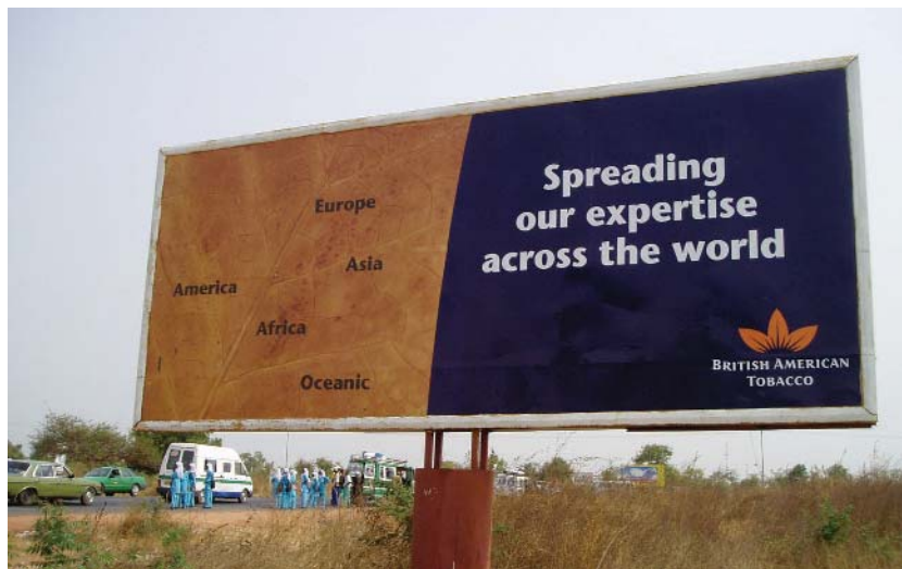
Gambia: BAT's boasts British American Tobacco's public relations advertisements hold a second, sinister meaning for African tobacco control advocates trying to prevent increasing recruitment to smoking in some of the world's poorest countries.