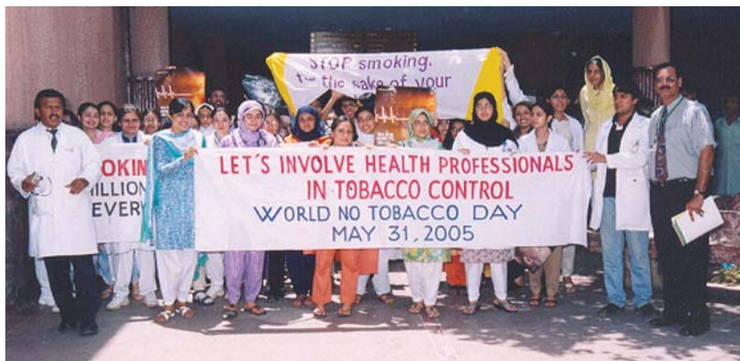
Pakistan: health professionals rally Medical students and staff from the Aga Khan University, Karachi, with the banner they used on World No Tobacco Day (31 May) calling for greater involvement in tobacco control by Pakistan's health professionals. Some 50 doctors, mostly members of the Pakistan Chest Society, joined students and others at events to mark the day, including a funeral procession with a giant cigarette instead of a coffin.

internet website, but the sale drew widespread attention and more than 130 000 bids earlier this year. It was not just any old butt, but one certified by the owners of Malt, a popular bar in Auckland, New Zealand's largest city, to be the remains of the last cigarette