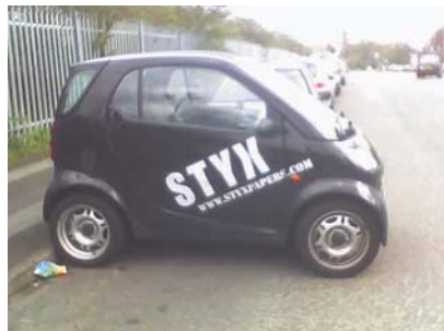
Eye catching cars, decorated with the Styx name and logo, were offered to students in a competition organised by Swedish Match UK.

The Styx boxes distributed to students contained a reference to a website ( http://www.styxpapers.com ) clearly aimed at a youth audience, but with no manufacturer details. The website included details of recruitment opportunities last December, for students to give out free samples. But the promotion was not limited to cyberspace—eye catching Smart cars, highly popular among young people, and conspicuously decorated with the Styx name and logo, were being driven and parked in areas frequented by students. Even the most basic Smart car retails for around £6800 (US$12 500) in the UK, some 31 000 times the price of a pack of Styx papers.