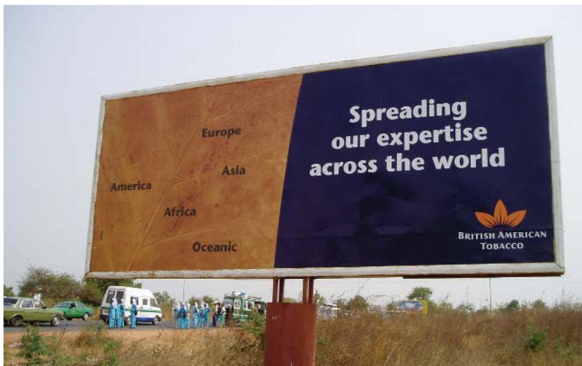
Gambia: BAT's boasts British American Tobacco's public relations advertisements hold a second, sinister meaning for African tobacco control advocates trying to prevent increasing recruitment to smoking in some of the world's poorest countries.