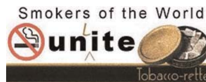
An advertisement for the Swedish Match company's oral tobacco product, Tobaccorette.

As public health workers around the world continue to debate harm reduction policies, including the place within them of oral tobacco, South Africa may be about to see whether a significant new body of South African cigarette smokers replaces some or all of their smoking with snus. They will also be watching to see how BAT markets the product and whether it tries to make health claims about it. Last year, scientists at the University of Pretoria confronted Swedish Match about health claims on a website advertisement that implied that Tobaccorette had no health hazards. The company later shut down the site, claiming it had not approved of the ad.