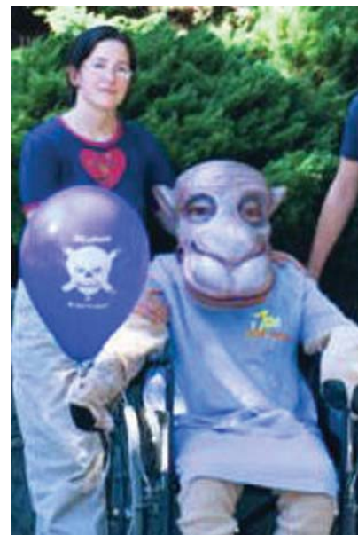
Joe Chemo, a satirical character used in demonstrations against tobacco promotion before Canada’s total ban, being wheeled to a tobacco sponsored fireworks display in Vancouver. This sort of story and image regularly appeared on the bensonandhedges.org website.

For some years now, health organisations in several countries have been using creative internet strategies to counter tobacco promotions. One technique is to set up a health oriented website with a very similar name to a tobacco industry site involved in cigarette promotion aimed at internet savvy young people. The key feature of the health site is to give the lie to what the industry site is really all about. For example, in 2002, when BAT was caught out for the second time trying to encourage young people to attend venues where it sold and promoted its cigarettes by using a site called www.citygobo.com , Action on Smoking and Health UK (ASH) set up www.citygobo2.com , which left visitors in no doubt at all about what BAT was up to