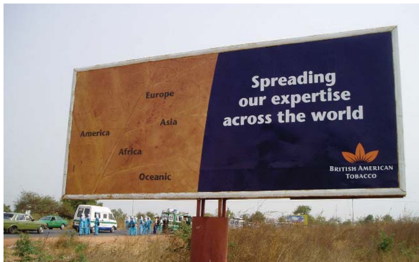
Gambia: BAT's boasts British American Tobacco's public relations advertisements hold a second, sinister meaning for African tobacco control advocates trying to prevent increasing recruitment to smoking in some of the world's poorest countries.