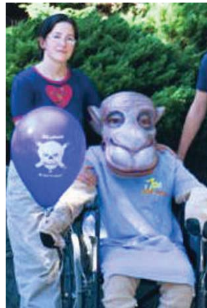
Joe Chemo, a satirical character used in demonstrations against tobacco promotion before Canada’s total ban, being wheeled to a tobacco sponsored fireworks display in Vancouver. This sort of story and image regularly appeared on the benensonandhedges.org website.

UK: Scotland prepares for smoke-free vote A postcard developed by CAN!, a coalition group campaigning for “cleaner air now”, for people in Scotland to use to lobby members of the Scottish parliament to support a bill to make all workplaces smoke-free, along the lines of the pioneering legislation in Ireland.