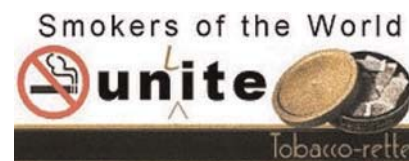
An advertisement for the Swedish Match company's oral tobacco product, Tobaccorette.

As public health workers around the world continue to debate harm reduction policies, including the place within them of oral tobacco, South Africa may be about to see whether a significant new body of South African cigarette smokers replaces some or all of their smoking with snus. They will also be watching to see how BAT markets the product and whether it tries to make health claims about it. Last year, scientists at the University of Pretoria confronted Swedish Match about health claims on a website advertisement that implied that Tobaccorette had no health hazards. The company later shut down the site, claiming it had not approved of the ad.