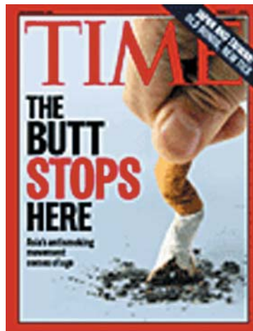
Unfortunately, the butts pile up in Asia as consumption rises precipitously and the industry targets women and the poor.