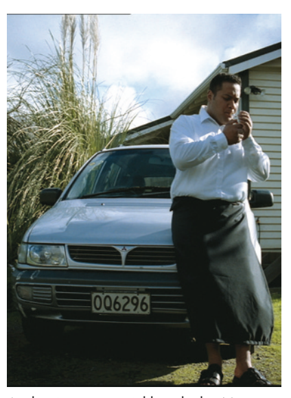
A television commercial launched in New Zealand has specifically targeted Pacific peoples, warning about the risk of heart attack associated with smoking.

was high and also resulted in interest throughout the Pacific, with news items about smoking and the campaign being aired in countries such as Samoa.