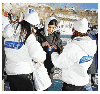
Young women dressed in Gitanes branded jackets distributed free cigarettes before a car rally and ski race at the Faqra Club mountain resort in Lebanon.

Just one of the cigarette promotions taking place in February was held at a car rally and ski race at the Faqra Club mountain resort, and was part-spon-