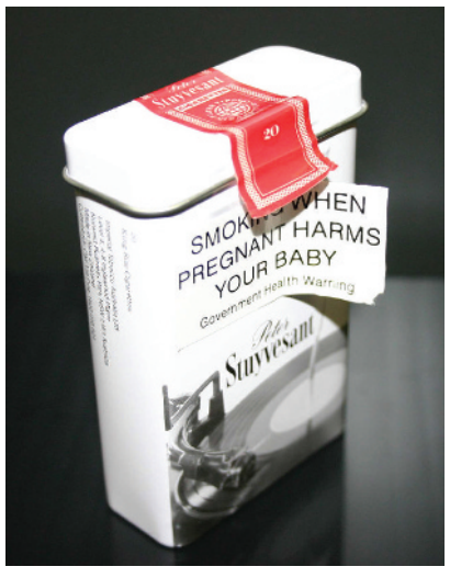
An Australian tobacco company recently marketed its product in tins, with health warning stickers that could be peeled off easily.

However, a month before the regulation came into effect a tobacco company was caught marketing cigarettes in trendy retro-style tins which, unlike packets of cigarettes with printed warnings, had health warning stickers that were easily peeled off. The manufacturers appeared to be taking advantage of an apparent loophole in regulations that allow cigarettes not sold in the traditional soft packs or flip tops to carry