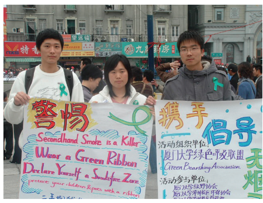
Students in Xiamen, China are helping to raise awareness about the health problems caused by smoking.