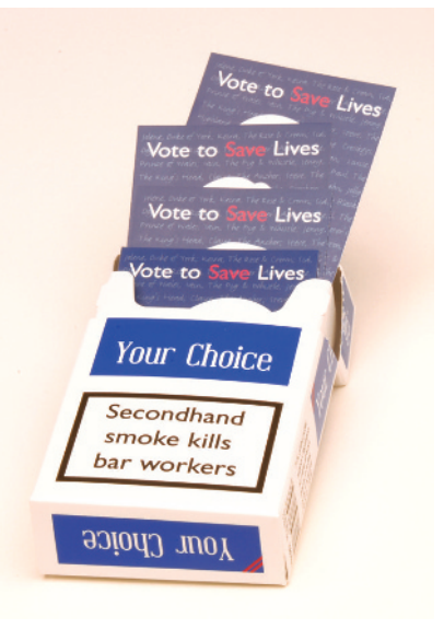
UK: politicians sent fake cigarette packs Earlier this year, as members of parliament were preparing to debate what sort of smoking restrictions English workplaces should have (Scotland had already decided on a full ban), Cancer Research UK sent all members of parliament a fake cigarette pack with warnings such as "Second-hand smoke kills bar workers". Given the unusual luxury of a free vote, with no guidelines or orders from party "whips" about which way to vote, an overwhelming vote was registered for a total workplace ban, genuinely representing what public opinion polls had been showing for a long time.

But what about the workers? The law cites the International Agency for Research on Cancer (IARC) report on passive smoking, recognising that it can