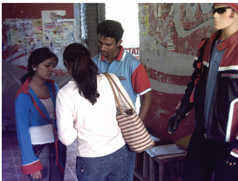
"Researchers" from Philip Morris' subsidiary in India illicitly conduct cigarette promotions inside one of the country's premier educational institutions, Punjab University. Note the mannequin dummy (right) displaying gifts available on purchase of the brand under promotion.

The moment they find any young person showing the slightest interest, they are immediately engaged in conversation about the launch of a new brand, emphasising that this is a milder version of the cigarette. Brochures explaining a prize scheme involving winnings such as mobile phones and other attractive gifts are produced. Free cigarettes are then offered. The next step