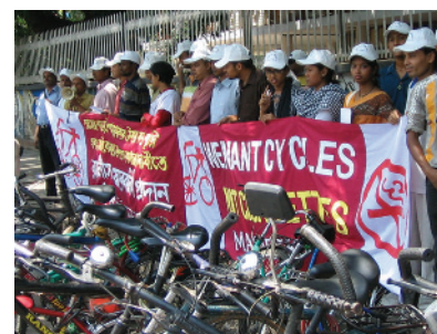
A cycle rally was held in the Bangladesh capital Dhaka to demand an increase in tobacco taxes—and a decrease in bicycle taxes.

In April, MANOBIK, a campaigning non-governmental organisation working against the harm caused by drug