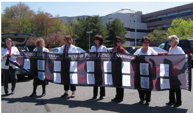
Nurses from the Nightingales group make their presence felt at the annual shareholders meeting of RJ Reynolds American.

their legal challenges to effective tobacco control legislation.