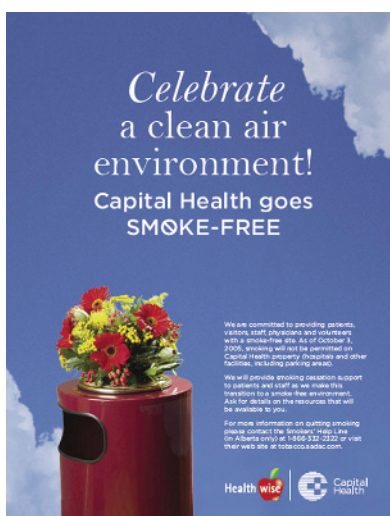
Capital Health, one of Canada's largest health authorities, has banned all smoking on its outdoor property, as well as indoors, including psychiatric and geriatric units.

However, once the distinction between supporting involuntary abstinence (while