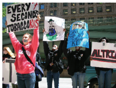
Demonstrators outside Altria's New York headquarters, their mouths taped shut to symbolise the millions of people "silenced" by tobacco every year.

Altria Group, the parent company of Kraft, Philip Morris USA and Philip Morris International, held its meeting at the end of April. More than 100 youth and adult advocates from the USA and around the world participated in advocacy events focused on the meeting. A youth advocacy training day was followed by a demonstration in front of Altria's headquarters in New York the next day as the meeting convened. The demonstrators called on Altria/Philip Morris (PM) to "Give the World a Break" from tobacco advertising, lobbying on the Framework Convention on Tobacco Control (FCTC), bogus "youth smoking prevention" programmes, and