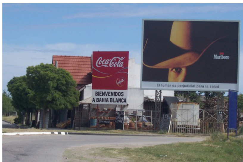
Argentina: PM ads and educational materials In Latin America, Philip Morris (PM) has sponsored a school programme “Yo tengo poder” (I have power) through a non-governmental organisation, giving information to teachers and students which it says is to prevent young people from starting to smoke. In some countries, the company is even allowed to work with the government. In Argentina, PM won an award for its work with the community. But in Bahia Blanca, on the coast to the north of Patagonia, there are few laws on tobacco control and many cigarette advertisements on the streets, with a special focus on teenagers and girls. The local government support the development of smoke-free places and it is forbidden to smoke in the hospital, but despite this, inside the hospital there are frequently huge tobacco ads from PM, and visitors arriving in the city via the main street are welcomed by a message on a large Marlboro billboard.

Although the policy came into effect in October 2005, psychiatry, palliative care, geriatrics, brain injury, and tuberculosis units were granted a grace period until 1 April 2006. This extra time was considered necessary because of concerns that psychiatric patients would abscond to purchase cigarettes; tuberculosis patients could infect others by