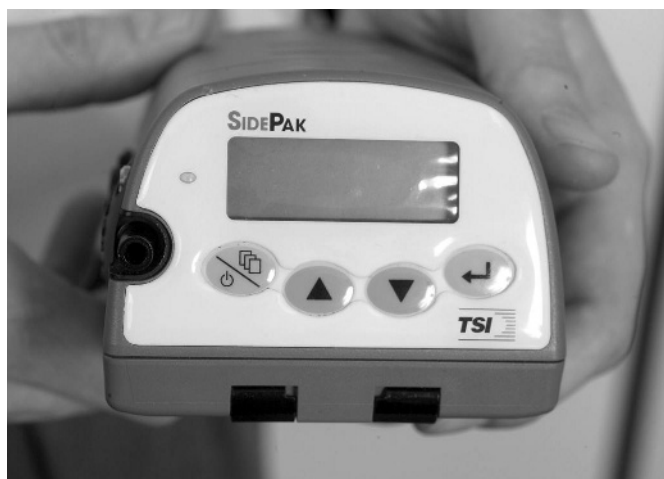
Figure 1 The TSI SidePak AM510 Personal Aerosol Monitor.

The primary goal was to assess the difference in the average levels of \text{PM}_{2.5} in venues that were smoke free (no smoking observed during sampling) and venues that were not (smoking was observed during sampling). All statistical analyses were performed using the log-transformed \text{PM}_{2.5} concentrations because these data are log-normally distributed, hence geometric means are compared. The comparison between smoking and smoke-free venues was performed within each country and pooled across all countries. A comparison was also made between the overall geometric mean concentration in the three smoke-free countries with comprehensive non-smoking policies (Ireland, New Zealand and Uruguay) and the other 29