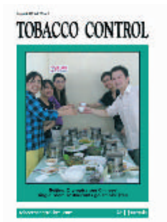
Cover: Beijing Olympics see Chinese single room restaurants go smoke free