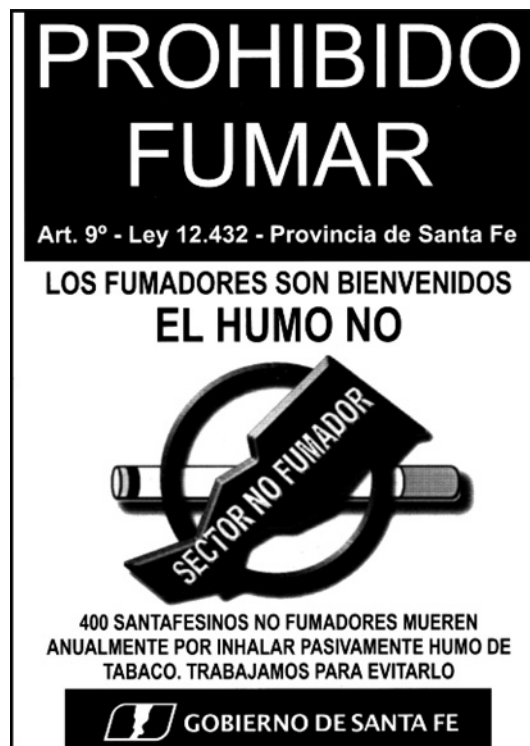
Figure 1 No smoking sign.