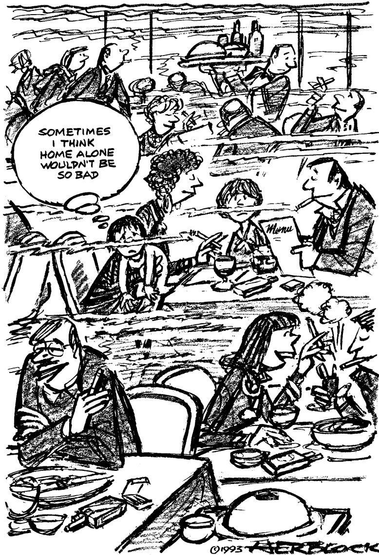
Copyright 1993, by Herb Block in the Washington Post