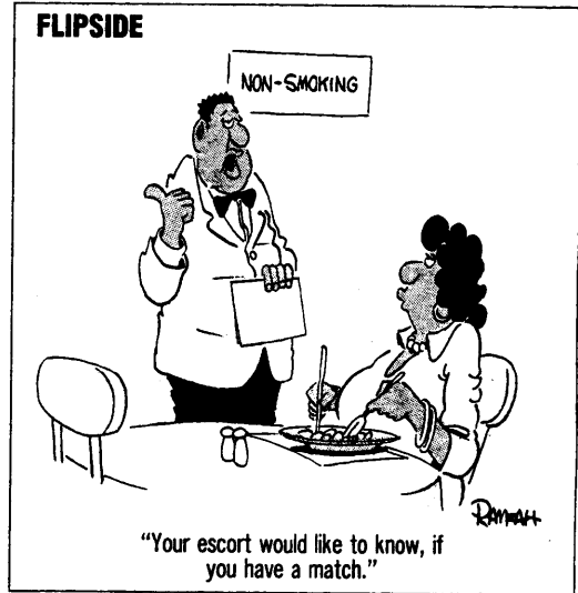
By Abdel Aziz Ramsah, reprinted with permission