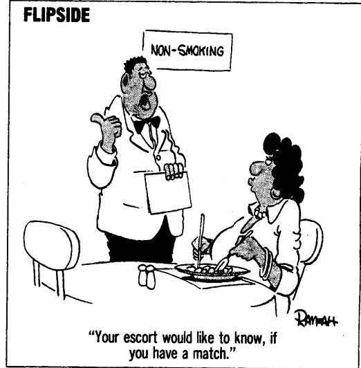
By Abdel Aziz Ramsah, reprinted with permission