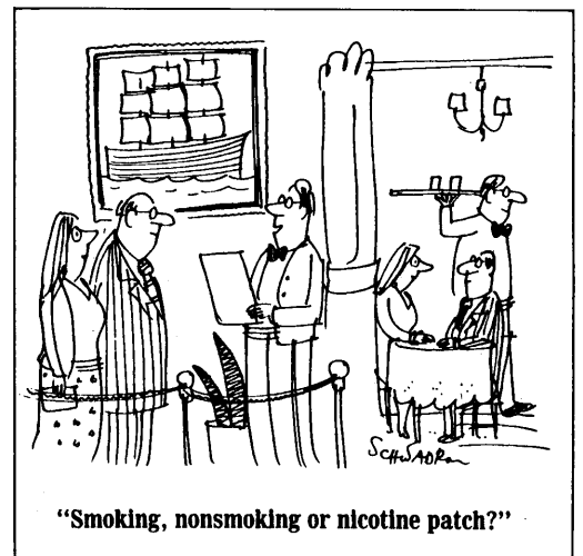
From the Wall Street Journal, reprinted with permission of Cartoon Features Syndicate