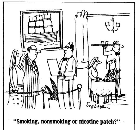
From the Wall Street Journal, reprinted with permission of Cartoon Features Syndicate