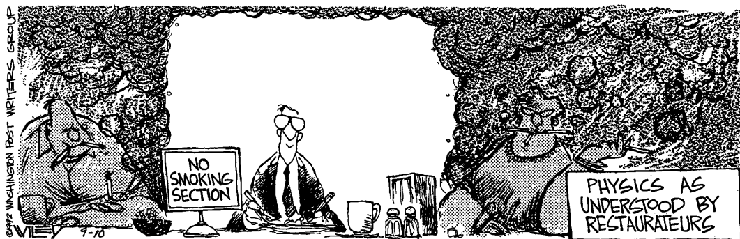
Copyright 1992, Washington Post Writers Group. Reprinted with permission