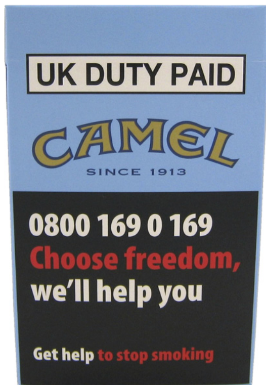
Figure 4 An example of supportive, cessation-oriented messages in the UK (2010).

The evidence also suggests that health warnings can promote smoking cessation and discourage youth uptake. Considerable proportions of smokers report that warning labels increase their motivation to quit and help them to sustain abstinence after quitting, and the use of effective cessation services increases after new health warnings have been implemented (figure 4). However, the impact of health warning labels depends upon their design: obscure text-only warnings appear to have little