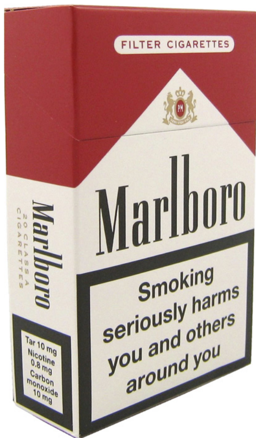
Figure 2 An example of EC/UK text-only warnings (2003).

information processing and improve memory for the health message.