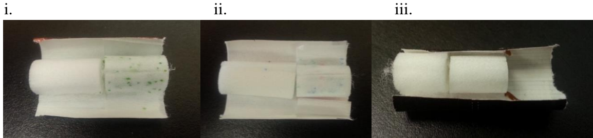
i. Green dalmatian filter found in Yuxi brand.

Supplemental Figure 1A) Two part filters