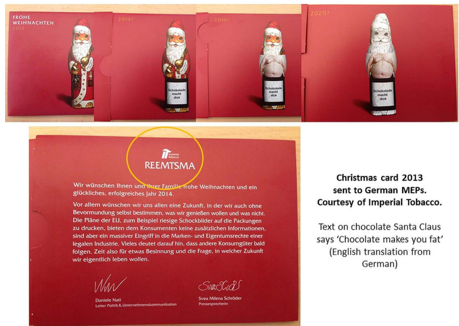
Christmas card 2013 sent to German MEPs. Text on chocolate Santa Claus says ‘Chocolate makes you fat’ (English translation from German)