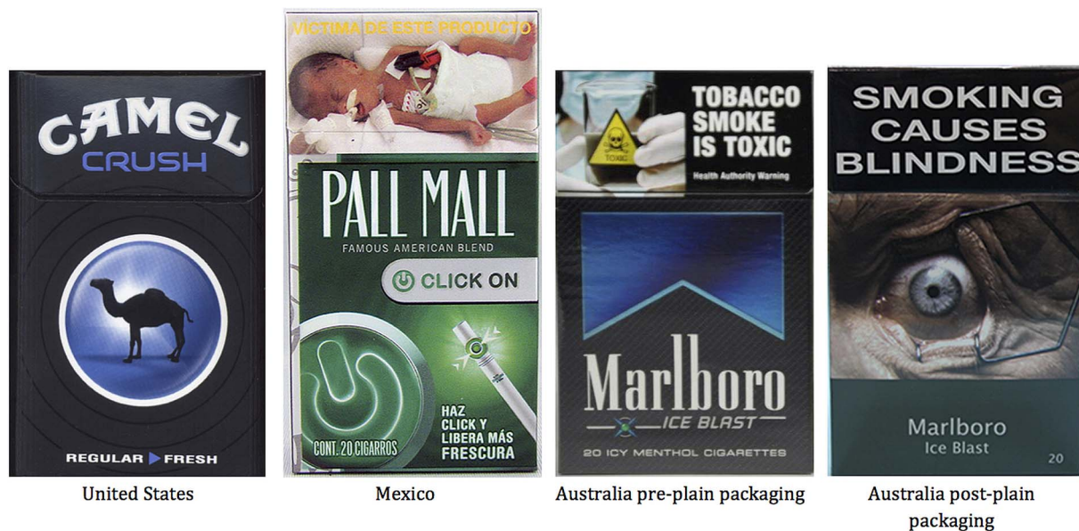
Figure 1 Example packages of brand varieties with flavour capsules in the USA, Mexico and Australia, 2014.

Brands were also classified into discount or premium price segments. For Mexico, national brands were classified as discount and international brands as premium, except for Pall Mall, as in prior research. 27 28 For the USA, we classified brands using a scheme developed in prior research that considered price and advertising image, 31 because both are critical to how the tobacco industry itself promotes premium brands. As such, this coding scheme involved assessment of pricing and tobacco industry representations of brands on industry websites and trade publications. Analyses by price segment were not