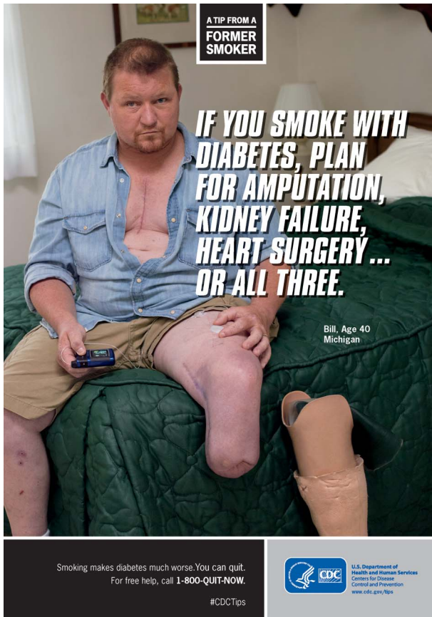
Figure 1 Print advertisement from the 2013 Tips campaign. CDC, Centers for Disease Control and Prevention; Tips , Tips From Former Smokers .

tobacco-related behavioural outcomes. Because even small changes in quit attempt rates are important at the population level, large samples are also necessary to detect effects.