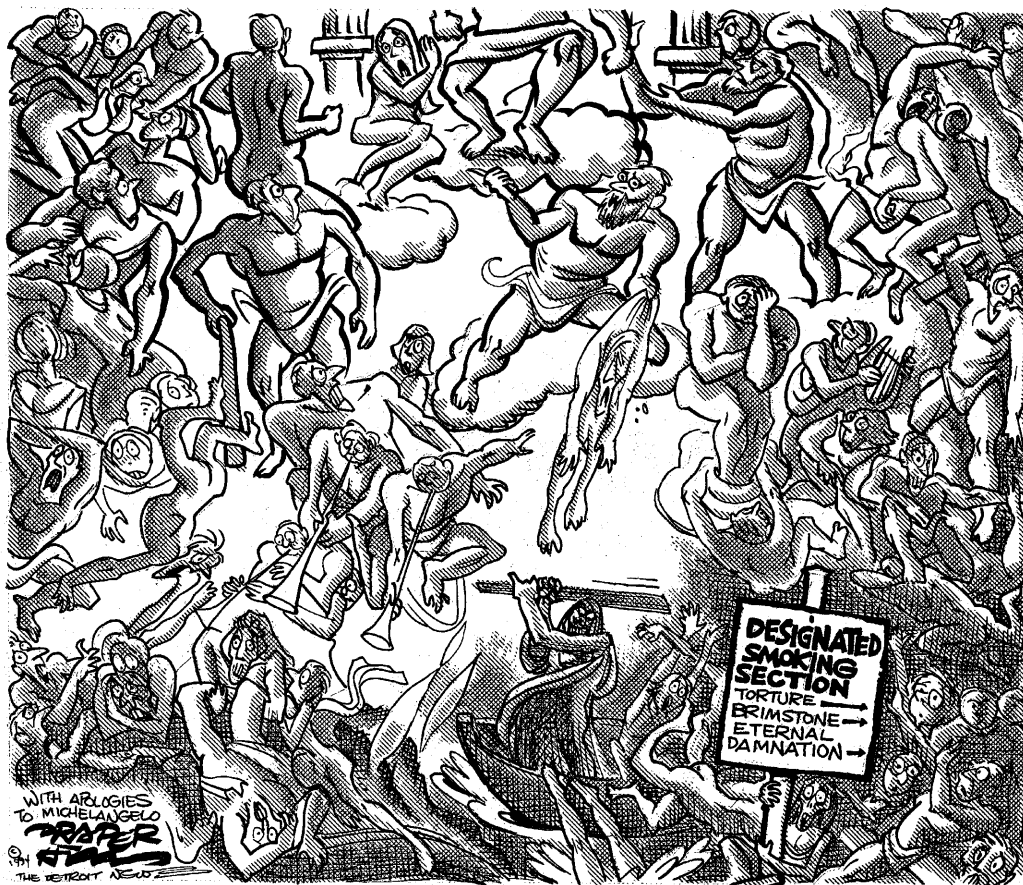
By Draper Hill for the Detroit News, © 1994, reprinted with permission