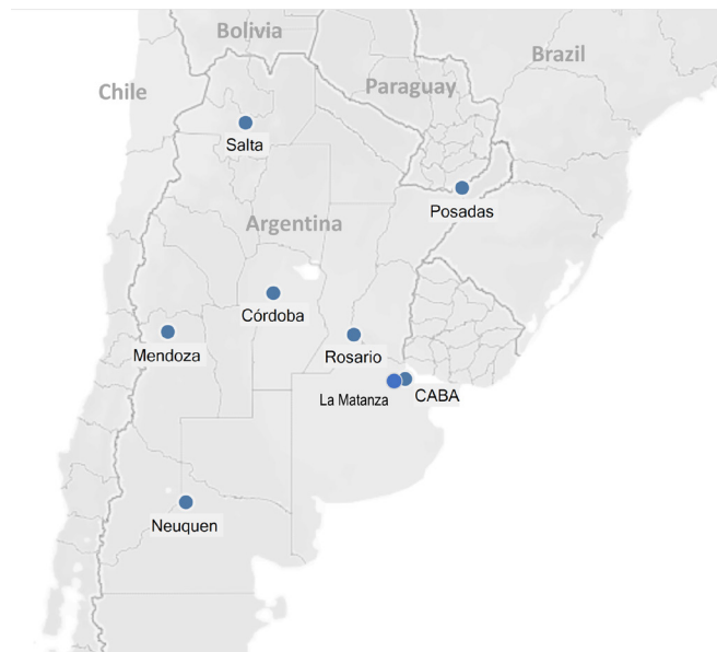
Figure 1 Location of the eight Argentinean cities included in the study.

A trained collector was instructed to recover every discarded cigarette pack along a route starting at the centre of each selected fraction and walking around four city blocks (400 m in perimeter