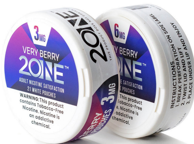
Figure 1 Products containing synthetic nicotine. (A) Puffbar line of electronic cigarettes containing synthetic nicotine, marketed since February 2021. (B) Next Generation Labs' description of synthetic nicotine. (C) 20ne nicotine pouches with warning label stating synthetic nicotine content, available for ordering on Amazon.com.

N-vinyl-2-pyrrolidinone to form myosmine, a tobacco alkaloid. Myosmine is reduced to nornicotine, followed by a methylation step resulting in a racemic (50/50) mixture of the nicotine stereoisomers, (S)-nicotine and (R)-nicotine. 16 NGL's intellectual property was recently recognised by Chinese authorities, enabling the company to enforce its patents in the country where the large majority of E-cigarette products are manufactured. 17 At least four other US-based E-cigarette vendors were identified