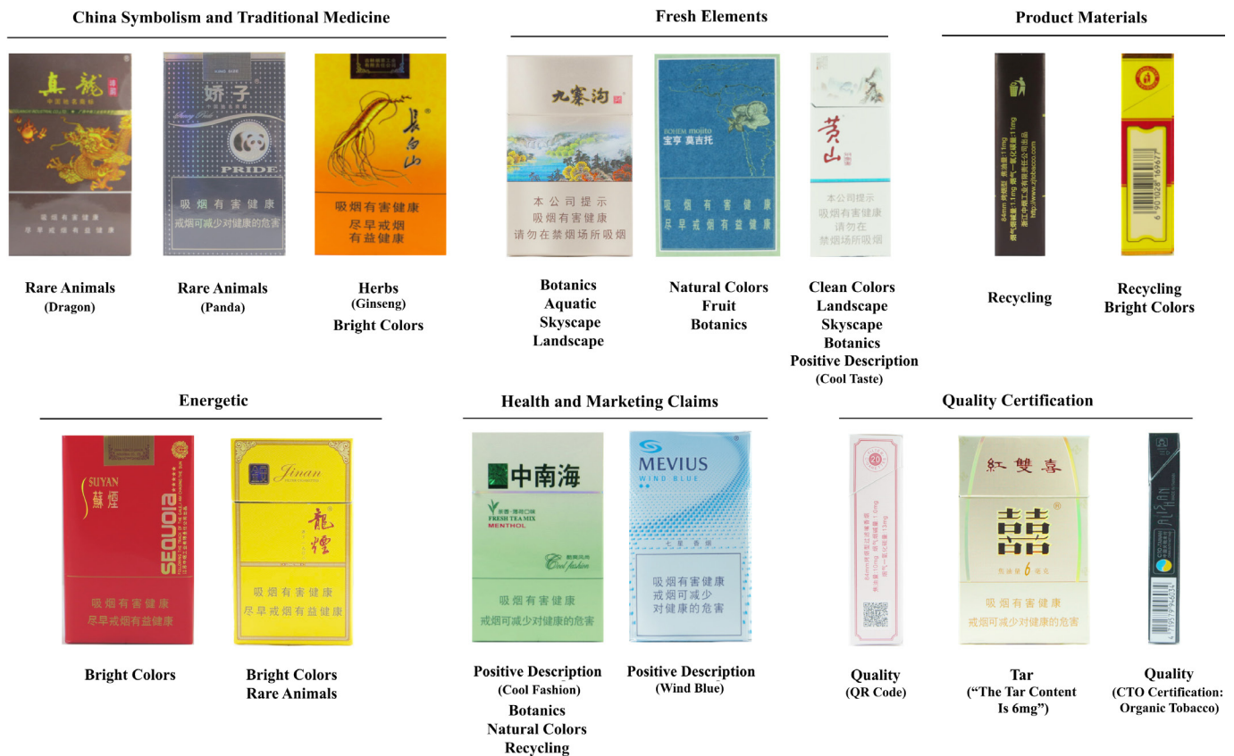
Figure 2 Examples of cigarette packs purchased in China across 'healthy' or 'good for me' appeal categories and features. * Packs in each appeals category may have 'health'/'good for you' features from other categories. CTO, certified organic tobacco.

a notable number of packs included textual descriptions of tar content (eg, '<6 mg tar') beyond the required tar yield information and sensory expectations (eg, cool, refreshing, blue) that could imply 'low tar' or 'light' cigarettes to consumers, 35 but would not be explicitly prohibited under the law. Our findings also indicate that tobacco companies are using other, culturally specific health features not covered in the current restrictions that could be uniquely associated with health-related perceptions among consumers in China. For example, this study and others documented the presence of quick response (QR) codes on Chinese cigarette packs that link to online programmes verifying the authenticity or quality of the pack, 36 which can improve consumer perception of the safety of a consumer good, like cigarettes. 37 38