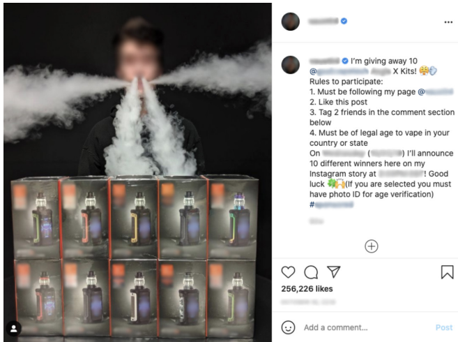
Figure 1 An example of violation of social media's platform policy that prohibits influencer posts with tobacco content. The influencer status of the "model" featured on this social media post was confirmed by a secondary source.

policies is common as can be seen in examples shown in figures 1 and 2. Figure 1 shows an example of a violation of social media platform policy that prohibits influencer posts with tobacco content. It shows a known influencer giving away an e-cigarette product through soliciting social media engagement (ie, liking, commenting). Figure 2 shows a violation of another social media platform policy that requires content that promotes a product that contains nicotine to be age-gated or removed and prohibits the selling of the product. The content shown in this figure was accessed through a non-age verified account and this post had an external link where the nicotine product can be purchased.