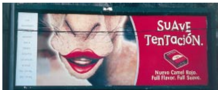
Figure 2 Camel lips.

Correspondence to: Program in Addictions, 317 George Street, Suite 201, New Brunswick, New Jersey 08901, USA; jdsllade@ix.netcom.com