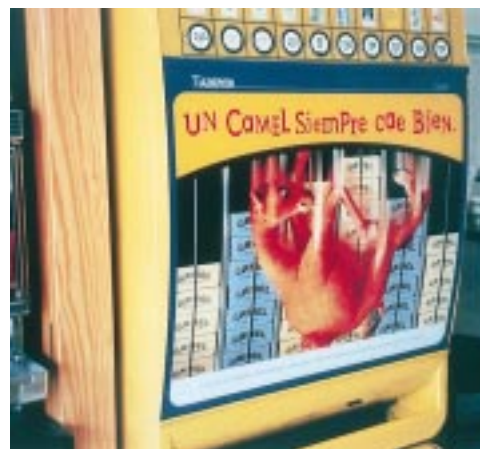
Figure 3 "Free fall" camel.

The campaign also was among the most notorious. Beginning in December 1991, a number of researchers called attention to the way the Joe Camel character was attractive to