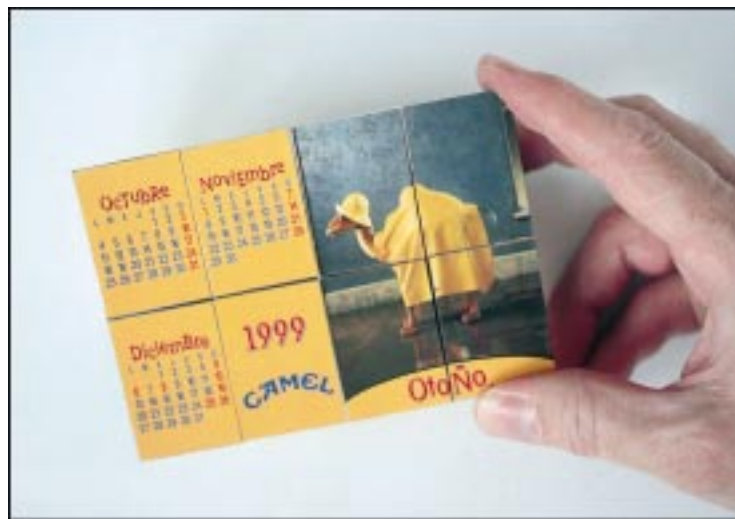
Figure 5 Camel protected from the rain.

In the meantime, another cartoon camel cigarette promoter was alive and well in Spain in February 1999. Its venues have included bus shelter advertisements (see cover), billboards (figure 2), vending machines (figure 3), and a small cube puzzle that folds and refolds into a 1999 calendar (figures 4, 5, and 6). The calendar cube was distributed with a popular magazine.