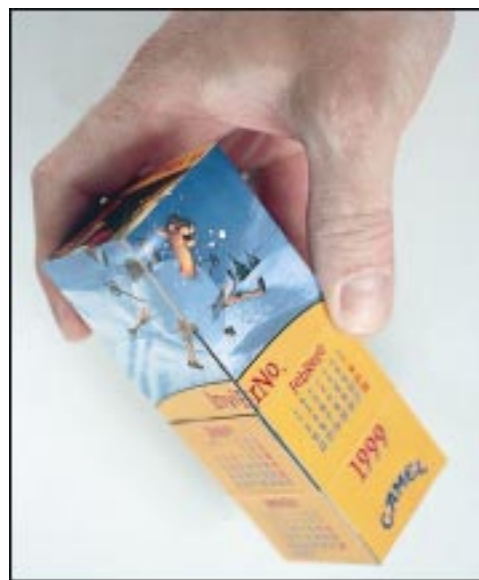
Figure 6 Camel on the slopes.

RJ Reynolds seems to be saying that it will remove Joe Camel here and abroad when it is convenient, but it will continue to use other cartoon camels where local law and regulation