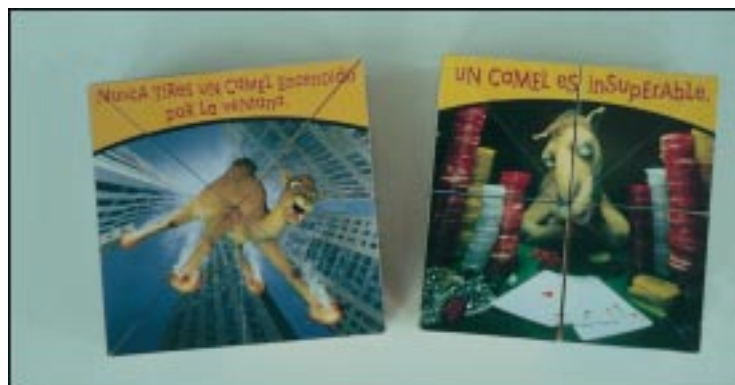
Figure 4 1999 Camel calendar cubes.