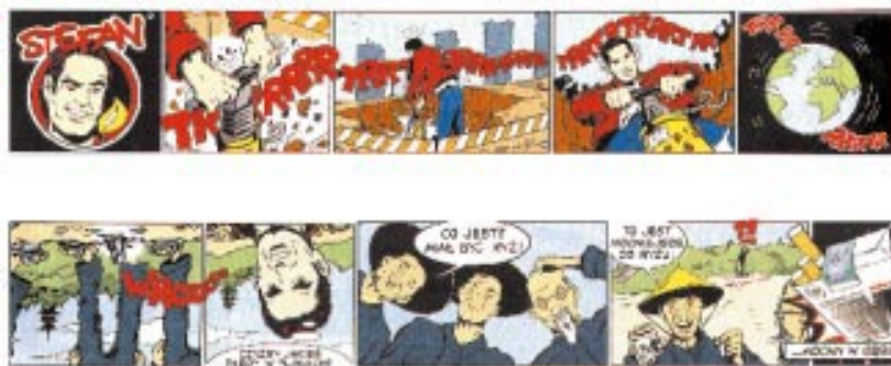
Cartoon strip run by Philip Morris Polska in a popular Polish TV guide.