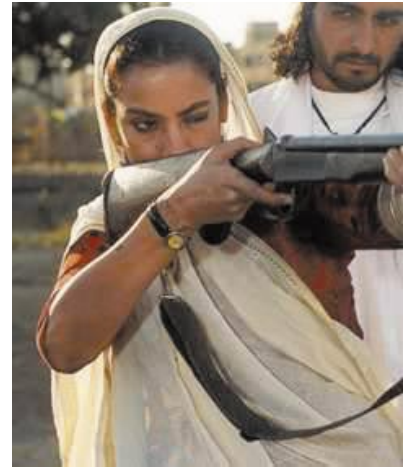
The well known Hindi actress, Ms Shabana Azmi, and two scenes from a film based upon the real life story of Santokben Jadeja, a woman from Gujarat who is currently a Member of the Legislative Assembly of India, and who comes from the traditional Mehr community where her smoking would be strictly taboo. Ms Azmi herself is considered the most socially conscious and socially active Hindi film actress — no better role model could have been found for introducing Indian women to smoking.

chased away from Sri Lanka's shores. Anti-tobacco banners were reportedly displayed at almost all police stations and schools, and at many road junctions in the city. Picketing and demonstrations took place at schools until the police chief of the province took the precaution of stopping them, in case any got out of control. Meanwhile a float in the form of a ship, decorated with skeletons and satirical anti-tobacco slogans, toured the city and visited schools.