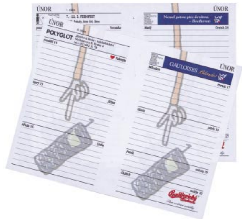
A "student diary" distributed free in the Czech Republic, bearing advertising for the Gauloises cigarette brand, Gauloises Blondes, both on the cover and on all the top right hand pages within the diary. Opposition from medical faculty members at universities in Prague and Brno managed to limit the distribution of these diaries.

But despite DownTown's intentions, not all students received the gift. Members of staff at Masaryk University in the southern city of Brno noticed that the top of all the right-hand pages of the diary was adorned with a coloured band showing the logo of the French cigarette brand Gauloises Blondes. In addition, each coloured band carried, alternately, a quotation from a famous person, or the brand's name. Appalled by the temerity of the scheme,