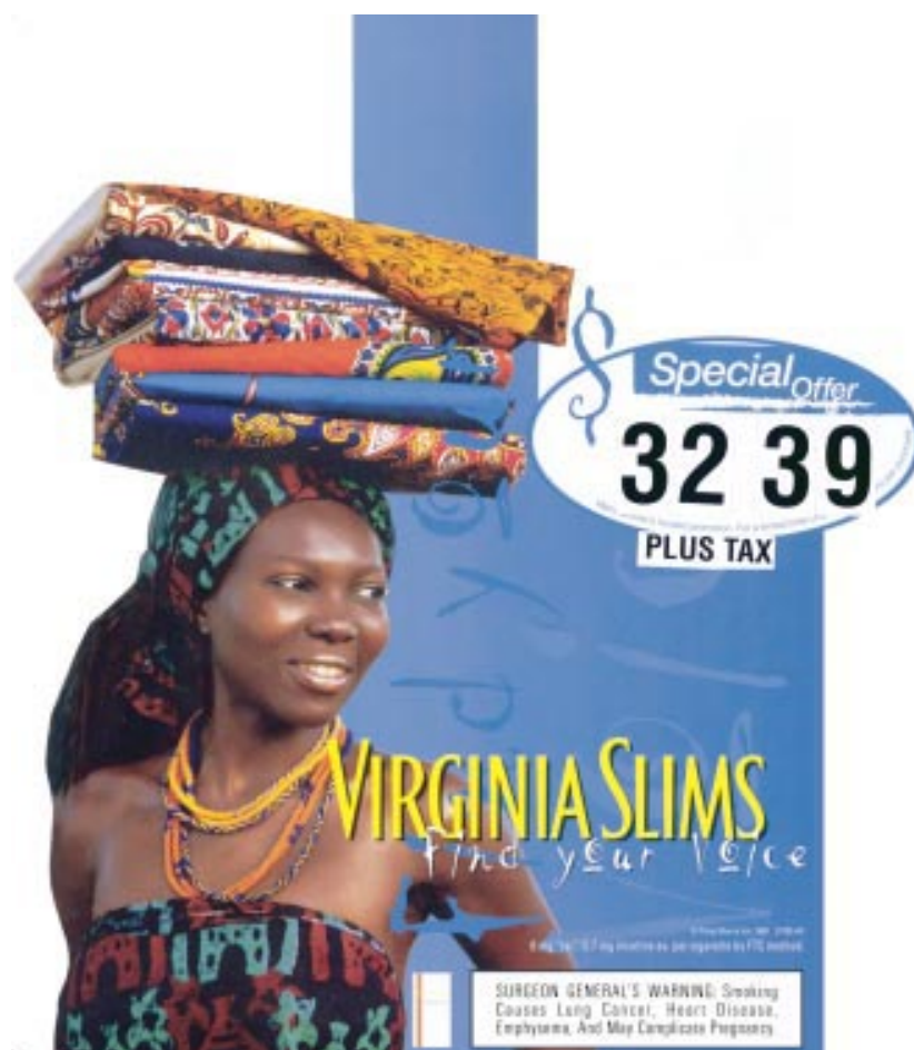
USA: Virginia Slims find your voice campaign. In what appears to be an appeal to back to roots sentiments, this advert portraying a woman in Africa is thought to be aimed at US African American women. It contrasts with cigarette advertising in African countries where western, especially American, models are often featured.

The attitude of the American delegation at the WHO consultative technical conference on the FCTC in New Delhi from 7 to 9 January 2000