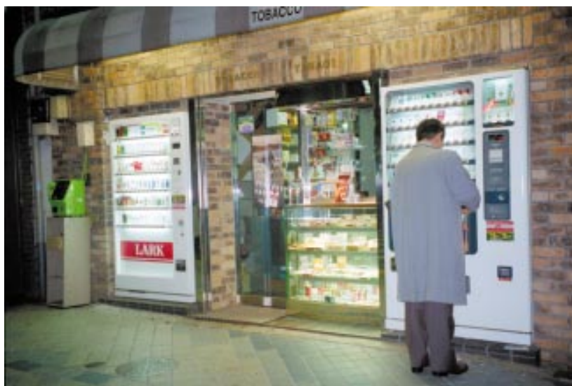
Cigarette vending machines on the streets of cities in Japan, like these ones seen in Kobe last November, make access easy for children.

Statistics make the story obvious. Japan's Tobacco Problems Information Centre estimates that minors consumed approximately three billion packs of cigarettes in 1996. This translates to roughly eight million packs obtained by minors each day. If late night vending machine operations