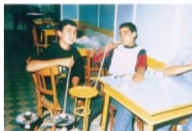
Syria: narguileh makes a comeback. Smoking narguileh (hubble bubble), a habit formerly confined mostly to older Syrian men (top), has recently started to attract wider usage, including at women's gatherings, and among teenagers (bottom).

of Bangladesh, and the long established tobacco control organisation ADHUNIK.