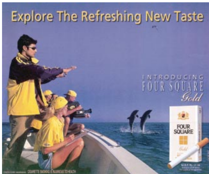
India: who's boss in the new world order? Look who's boss now. This advert for a new brand launched by Godfrey Phillips, a Philip Morris subsidiary, portrays a young Indian film director at work on a film shoot. The members of his crew are westerners, and the advert appears to exploit national pride in India's internationally successful movie industry. The cigarette makers said the setting of the advert, an adventurous and challenging shoot on water, fitted with the core brand values of daring dynamism with a spirit of outdoor adventure.