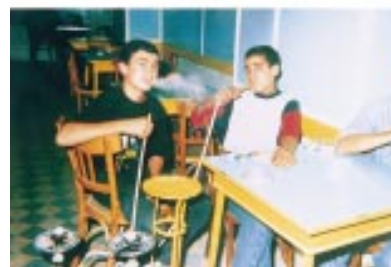
Syria: narguileh makes a comeback. Smoking narguileh (hubble bubble), a habit formerly confined mostly to older Syrian men (top), has recently started to attract wider usage, including at women's gatherings, and among teenagers (bottom).

of Bangladesh, and the long established tobacco control organisation ADHUNIK.