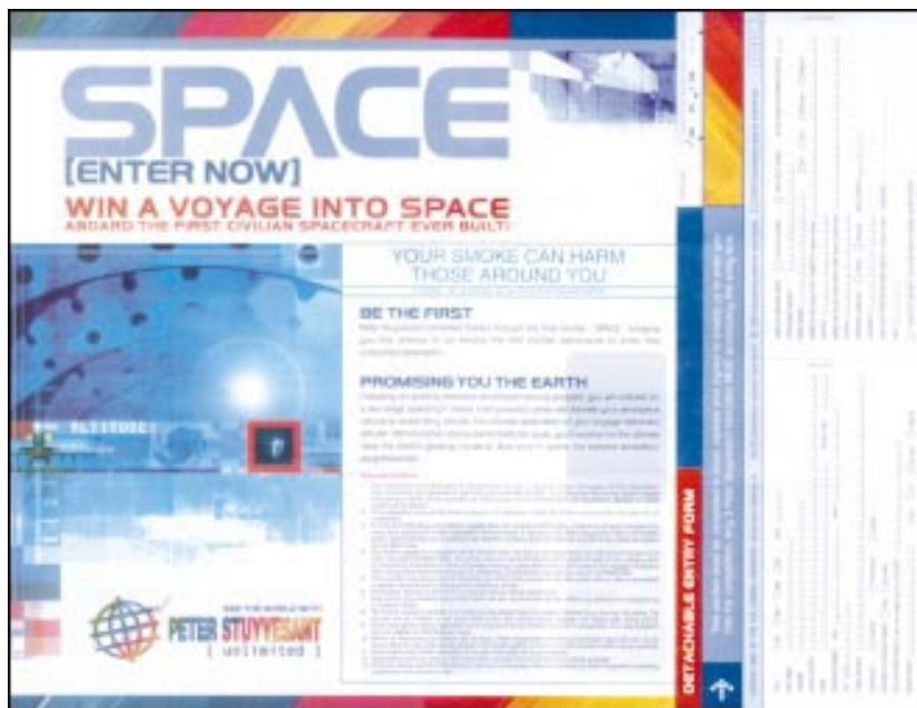
South Africa: an entry form for the Peter Stuyvesant "Spaceflight" competition run during 2000. All entrants, who had to submit bar codes from three packs of the sponsor's cigarettes, were entitled to win a cigarette lighter and a place in a weekly draw for a Palm 111c palmtop computer. The overall winner is to be given a place on the first commercial space voyage, target date 2003. It is thought the flight will be strictly non-smoking.

to take into account smoker compensation. Requiring a range of yields is a world first, as is requiring yields for six substances.